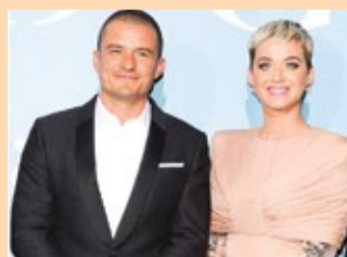
Orlando Bloom and Katy Perry

The 34-year-old singer was asked about her upcoming nuptials to the 42-year-old actor during an interview with Australia's KIIS 'Kylie