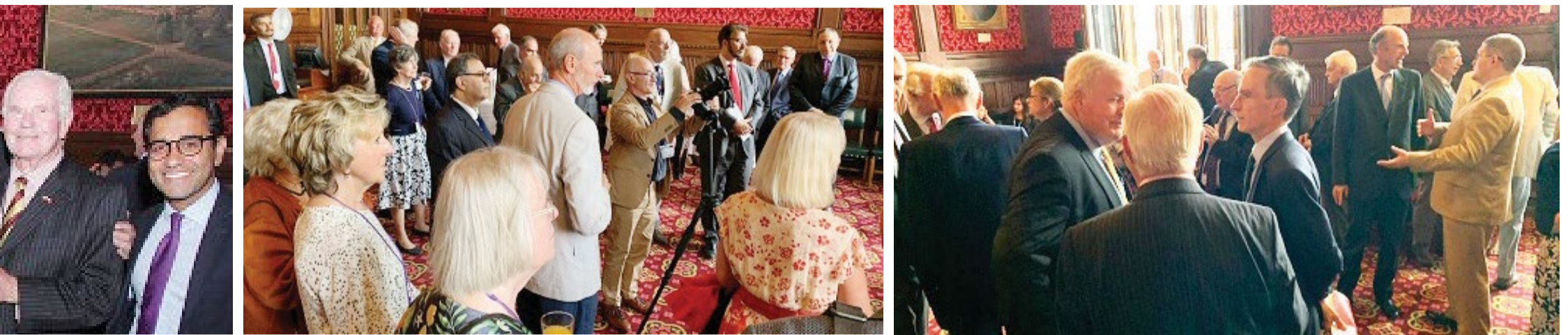
... Group and the Bahrain-British Friendship Society, under the patronage of the Ambassador of the Kingdom of Bahrain to the United Kingdom, Shaikh Fawaz bin Mohammed Al Khalifa. The ceremony was held in the presence of a number of Ministers, MPs and ... in the Labour Party, Fabian Hamilton, Shadow Minister for European Affairs, Khalid Mahmood, the former Minister of State for Middle East Affairs, Alistair Burt, as well as other politicians and MPs.