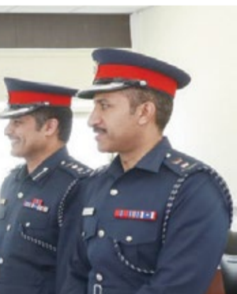
The Interior Ministry Undersecretary, Shaikh Nasser bin Abdulrahman Al Khalifa inaugurated on Monday two service centres at the Muharraq Security Complex and the General Directorate of Traffic. The move was part of the directives of Interior Minister, General Shaikh Rashid bin Abdullah Al Khalifa to open more services and provide further facilities for the citizens. The centres would issue good conduct certificates and other security-related certificates. Before visiting the centres, the required form should be printed from the Criminal Investigation Directorate www.cri.gov.bh .