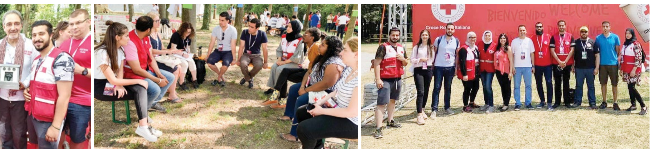
A number of its volunteers to participate in the "Youth Camp for Relief and Humanitarian Work", which was held recently in the Italian city of Sulfino, along with more than ten thousand volunteers from 140 countries. The Bahraini Red Crescent volunteers ... Federation of Red Cross and Red Crescent Societies, Francesco Rocca, who visited the camp and talked with everyone about the importance of relief and humanitarian work in providing assistance to needy people, victims, refugees and victims, especially in ... conflicts, conflicts and natural disasters across the world.