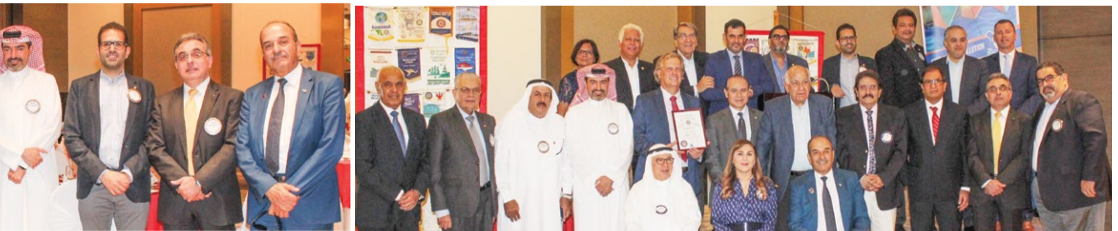
trauma and bankruptcy turned into advantages and an interesting life. He said his 15 months' stay in Bahrain and the Middle East have been one of the best experiences of his life.