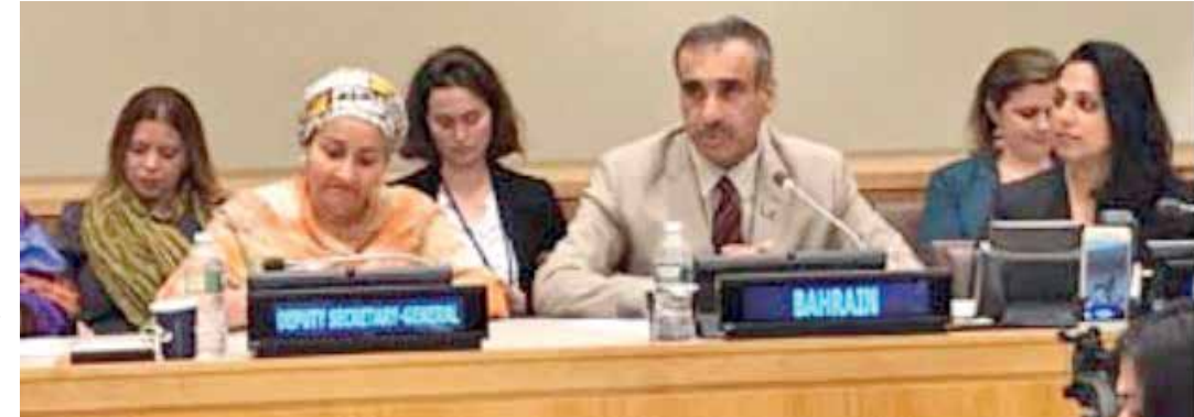
Housing MInister during UN-Habitat's panel discussion in New York, yesterday

The meeting held under the Speaking while participating auspices of the UN Economic in a panel discussion held with- and Social Council was on the in the Ministerial Meeting of sidelines of the kingdom's presthe High-level Political Forum entation of its first Voluntary (HLPF) in New York, the min- National Review (VNR) on the ister also said that the ministry Implementation of the 2030 had signed a cooperation docu- Sustainable Development Goals