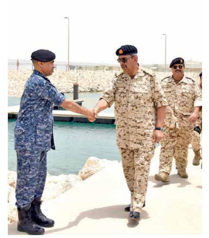
BDF Commander-in-Chief of Bahrain Defence Force (BDF) Field Marshal Shaikh Khalifa bin Ahmed Al Khalifa visiting a BDF unit, as part of an inspection visit to various unit to ensure the units combat and administrative readiness