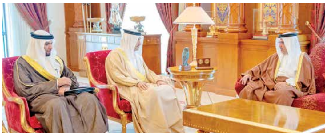
HRH Crown Prince during his meeting vesterday with Batelco Chairman at the Gudaibiya Palace

Highlighting the major role omy, HRH CP underlined the ef- and the Ministry of Telecom- national best practice," Prince ed the meeting.