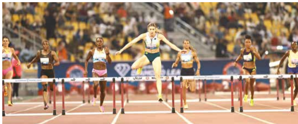
Action from the race