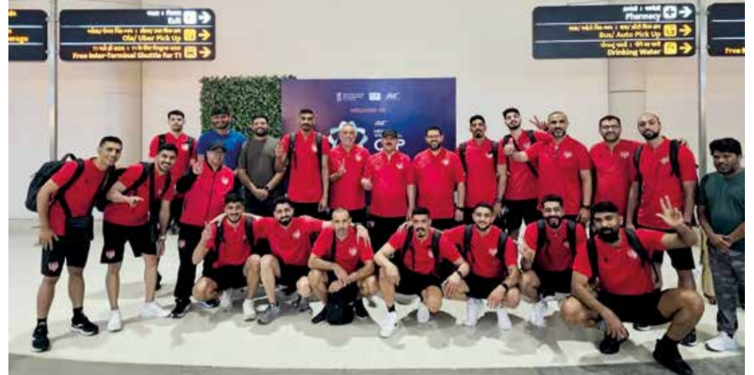
Bahrain's roster arrives in Ahmedabad, India

Following today's opener, Bahrain will take on New Zealand tomorrow before facing