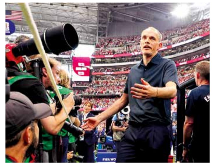
Thomas Tuchel, Manager of England, reacts as multiple photographers stand in front of him (file photo)