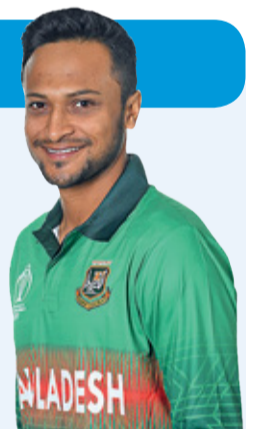
Shakib Al Hasan

» Australia have won four of their five matches at the World Cup so far, bouncing back from defeat to India by beating Pakistan and Sri Lanka in their last two games. » Bangladesh have won two matches so far and lost two others, with one match rained off - they chased 322 to beat West Indies by seven wickets last time out. » The Tigers boast the World Cup's leading run-scorer so far - Shakib Al Hasan having scored two centuries and two 50s on his way to 384 runs in four innings.