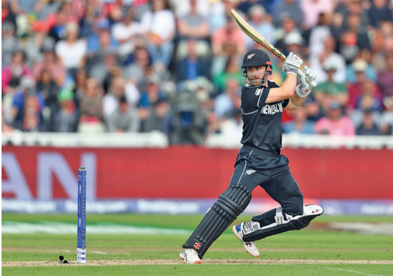
Kane Williamson plays a shot

Two overs later New Zealand slipped to 74-3 when Ross Taylor tickled a Chris