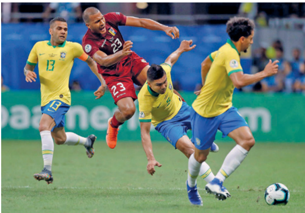
Venezuela striker Salomon Rondon, second left, vies for the ball with Brazil players Dani Alves, Casemiro, and Marquinhos

Brazil left the field to boos but remain top of Group A with four points from two games, and one game to play.