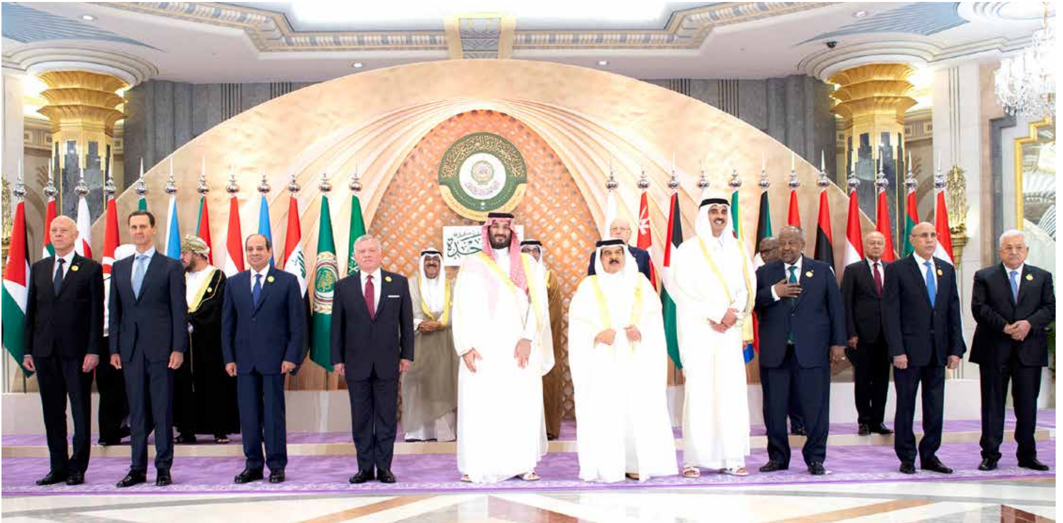
From left, Tunisia's Kais Saied, Syria's Bashar al-Assad, Egypt's Abdul Fattah al-Sissi, Jordanian King Abdullah II, Saudi Crown Prince Mohammed bin Salman, His Majesty King Hamad bin Isa al-Khalifa, Qatari Emir Sheikh Tamim bin Hamad al-Thani, Djibouti's President Ismael Omar Guelleh, Mauritania's Mohammed Ould Ghazouani and Palestinian Authority president Mahmud Abbas prior to the Arab Summit meeting in Jeddah.