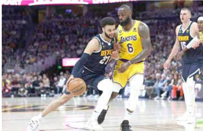
Jamal Murray (27) of the Denver Nuggets drives against LeBron James (6) of the Los Angeles Lakers

"The game would've been a lot easier if I made them the first