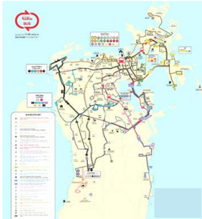
Representative picture

The Tender Board has accepted all bids, except for two which were subject to certain