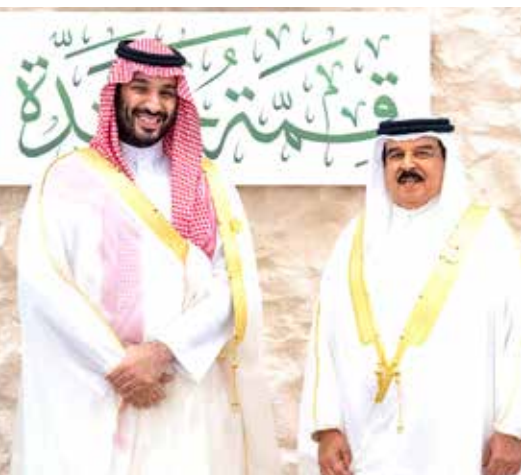
Saudi Crown Prince Mohammed bin Salman posing for a picture with HM King Hamad and Zelensky

It was the first time Assad had appeared at the Arab League since Syria was suspended in 2011. The summit also featured a