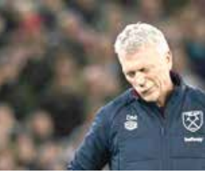
David Moyes

West Ham boss Moyes reveals family concern after violence at AZ Alkmaar