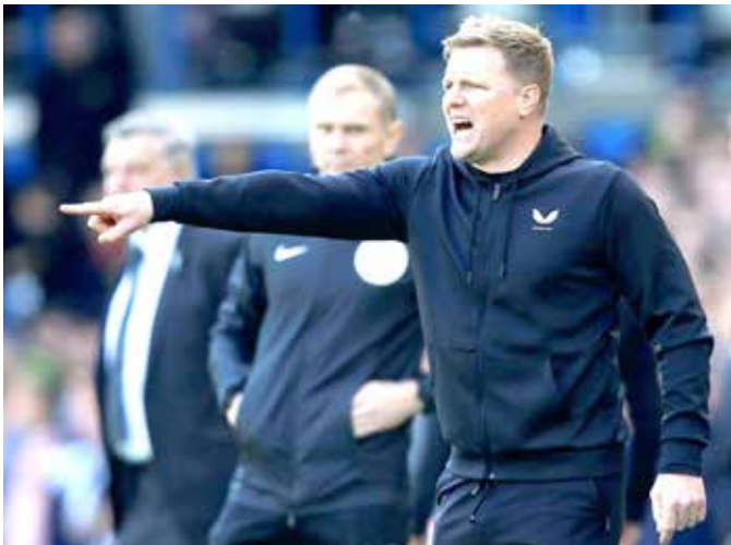
Newcastle United's head coach Eddie Howe reacts during a match (file photo)