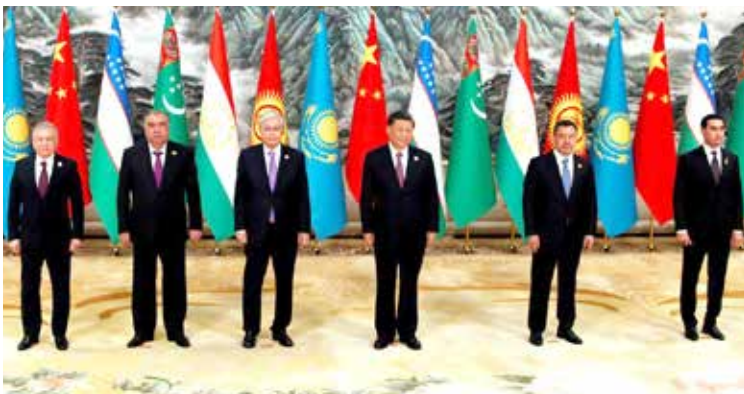
Chinese President Xi Jinping pose with other leaders for a group photo