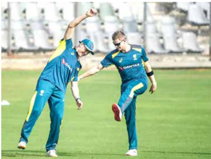
Marnus Labuschagne and Steve Smith during training (file photo)

Since then the veteran has made technical changes to his