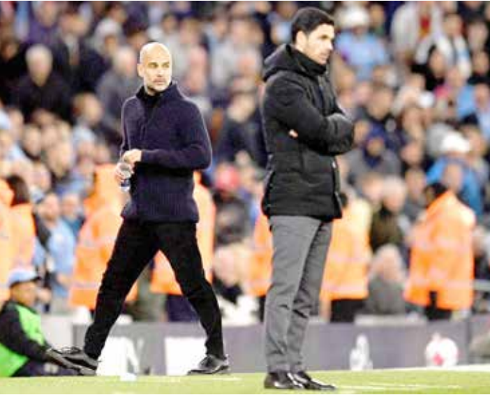
Manchester City's Spanish manager Pep Guardiola (L) and Arsenal's Spanish manager Mikel Arteta watch the players from the touchline (file photo)

Mikel Arteta insists Arsenal deserve respect for their unexpected Premier League title challenge despite the collapse that allowed Manchester City to move into pole position. City will be crowned champions if second placed Arsenal lose at Nottingham Forest on Saturday or if the leaders beat Chelsea on Sunday. One win from their final three games is enough for City to take the title for a fifth time in six seasons. It is a bitter pill to swallow for Arteta after his team led the title race for much of the season. The Gunners have endured criticism of their failure to hold off City, with last weekend's dismal 3-0 defeat against Brighton sparking questions about the character of Arteta's squad. But, in a thinly-veiled dig at their detractors, Arsenal boss Arteta said his team had surpassed expectations by pushing