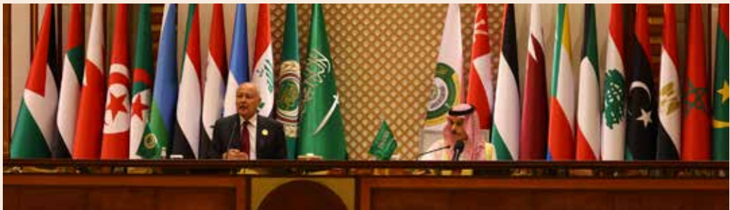
Arab League Secretary-General Ahmed Aboul Gheit (L) and Saudi Foreign Minister Faisal bin Farhan (R) attend a press conference held at the end of the Arab League Summit in Jeddah

It also voiced the importance of “activating the Arab Peace Initiative” which the kingdom proposed and the League endorsed in 2002.