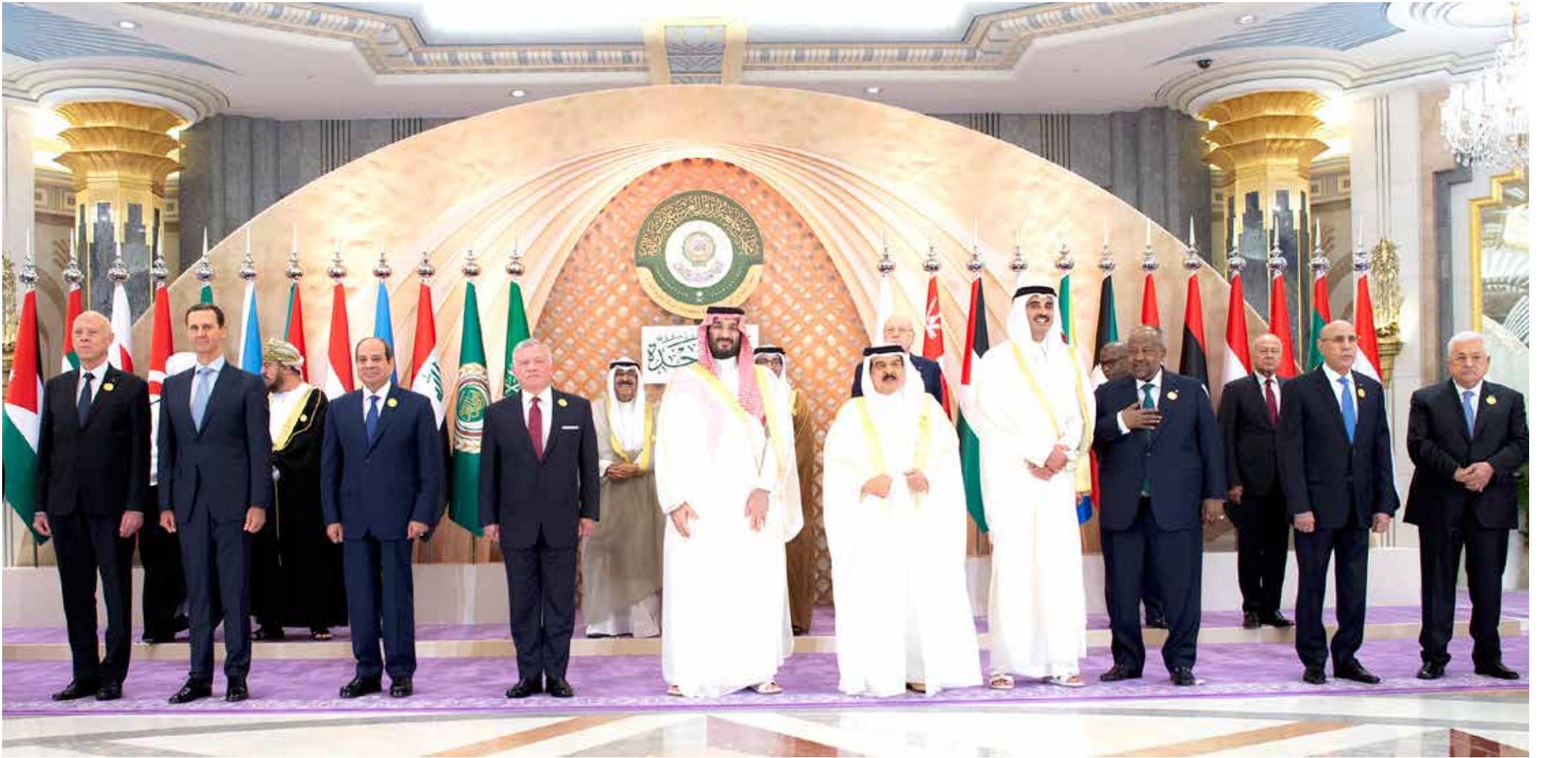
From left, Tunisia's Kais Saied, Syria's Bashar al-Assad, Egypt's Abdul Fattah al-Sisi, Jordanian King Abdullah II, Saudi Crown Prince Mohammed bin Salman, His Majesty King Hamad bin Isa al-Khalifa, Qatari Emir Sheikh Tamim bin Hamad al-Thani, Djibouti's President Ismael Omar Guelleh, Mauritania's Mohammed Ould Ghazouani and Palestinian Authority president Mahmud Abbas prior to the Arab Summit meeting in Jeddah.