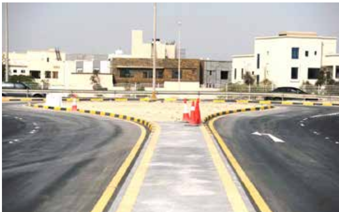
Representative picture.

ity, the project entails various enhancements to the single carriageway section.