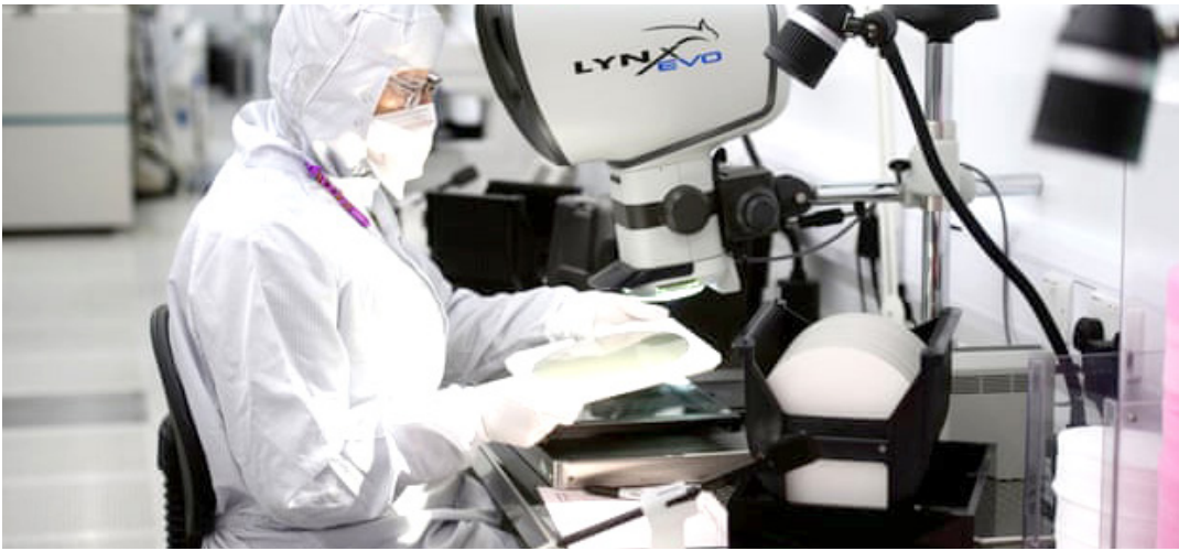
A worker at the silicon semiconductor manufacturer Nexperia at the Newport plant in south Wales

The investment over the next decade would include up to £200 million ($215 m) between now and 2025.