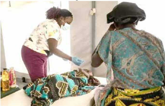
A health worker tends to a patient at a temporary cholera centre in Malawi

"With the increase in the number of countries affected by cholera, the resources that were available for prevention and response are more thinly spread," he said.