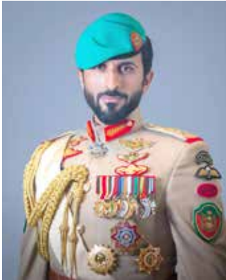
HH Shaikh Nasser

Highness Shaikh Nasser, who serves as the Secretary General of the Supreme Defence Council, National Security Advisor, and Commander of the Royal Guard,