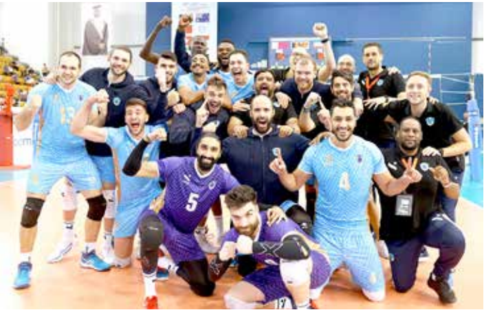
Qatar Sports Team after their victory

Despite their win, Kam Air are set to compete for 13th through 16th places, along with Aspiring.