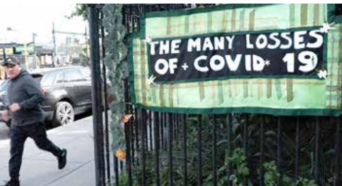
person walks by tributes in art made in Brooklyn, New York City

le, with the true figure believed to be closer to 20 million.