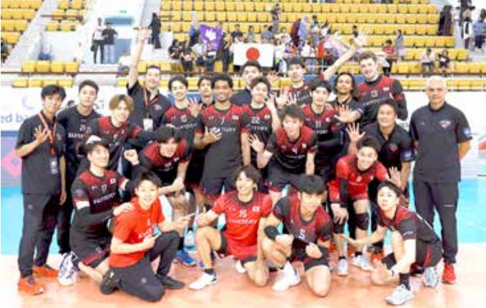
Japan's Suntory Sunbirds team celebrate their win

Jumbos are set to take on Kuwait while Bayankhongor face