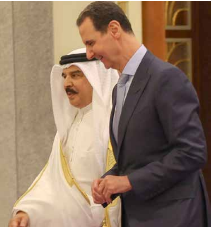
His Majesty King Hamad bin Isa Al Khalifa with Dr Bashar Al-Assad, President of Syria, on the sidelines of the 32nd session of the Arab Summit currently in Jeddah.