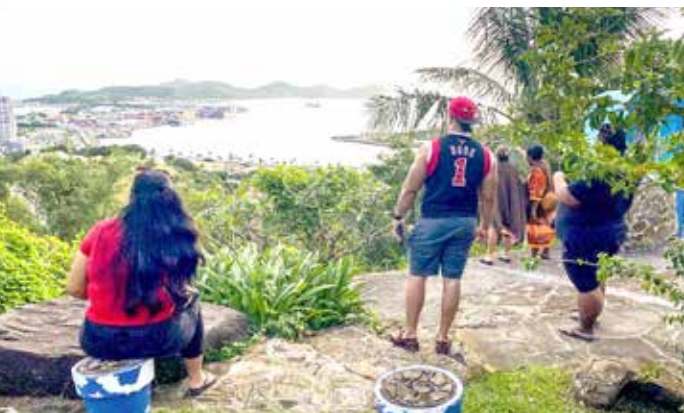
People look out toward the seafront from the Vierge du Pacifique in Noumea after an earthquake hit the island

warnings for coastal areas within 1,000 kilometres (620 miles) of the epicentre, which lay east of the French Pacific territory of New Caledonia.