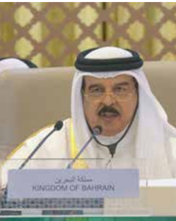
HM King delivers speech in 32nd Arab Summit

AFP quoting an Arab League official later reported that