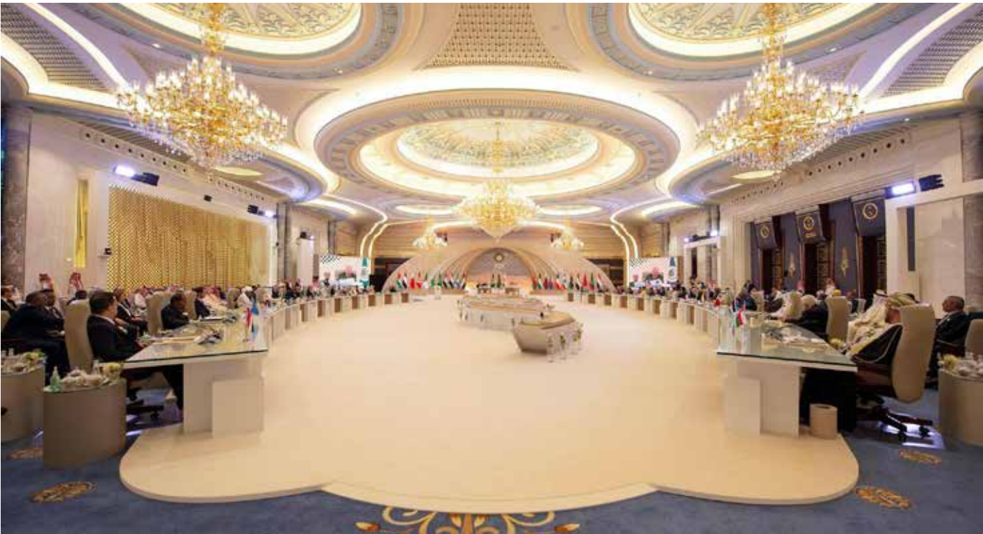
A general view of the Arab League Summit in Jeddah