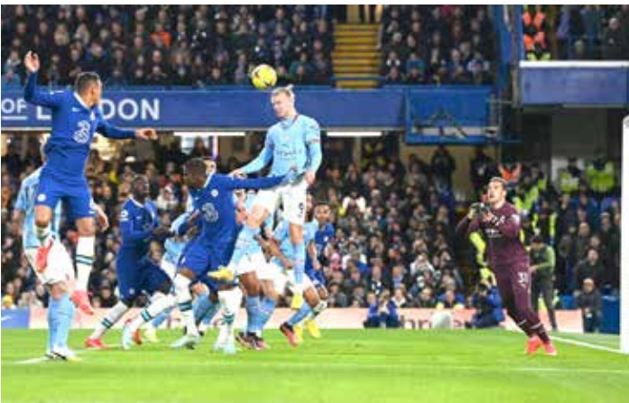
Manchester City’s Norwegian striker Erling Haaland (C) headers the ball clear during a match against Chelsea (file photo)

“I think he’s special, I thought he’d adapt straight away just because of his level.”