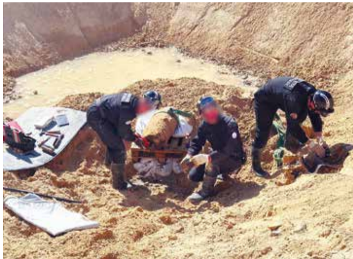
members of the police Explosive ordnance disposal unit (EOD) operating to neutralise a bomb from World War II partially uncovered near a residential area, in Paris' northwestern suburb of Colombes

The controlled explosion was ordered after specialists had failed in one bid to remove the detonator from the explosive,