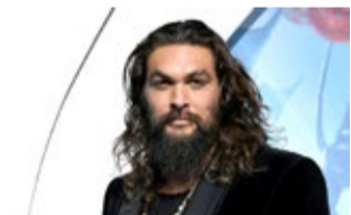
Jason Momoa Los Angeles

"Aquaman" star Jason Momoa has bid farewell to his signature beard after seven years of not shaving, and it's all for a good cause.