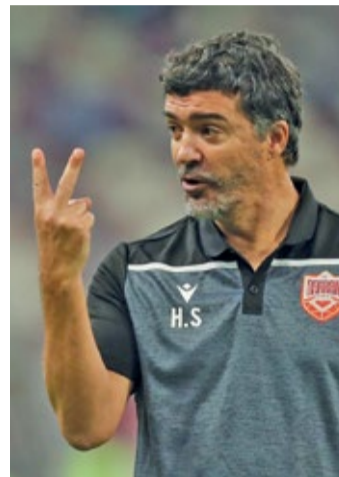
Sousa reacts during a match (file photo)

There are currently no players called up from Bahrain league champions Riffa and Manama, as both teams are set to play in the AFC Cup club competition next week.