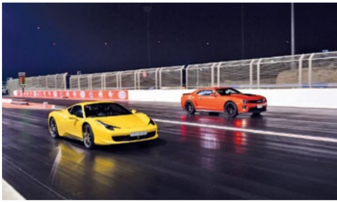
Cars in action at BIC