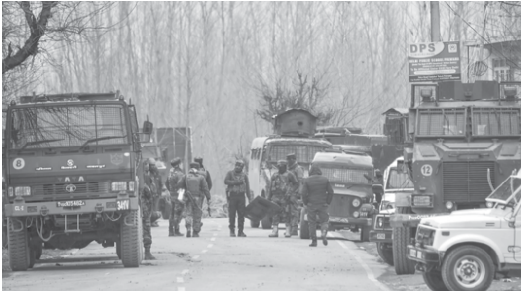
Indian security forces personnel are on manoeuvres as a gunfight with militants has happened that killed 4 soldiers, in South Kashmir's Pulwama district, some 10 km away from the spot of recent suicide bombing

kistanis, including the group's "chief operations commander" in Kashmir, the army general said.