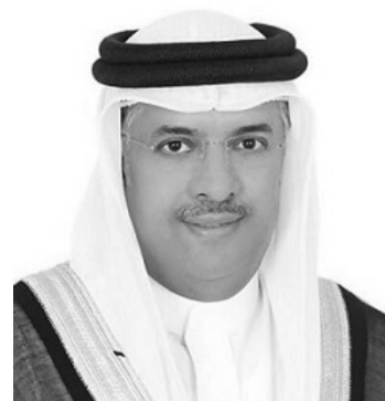
Mr Al Doseri

This came as the Assistant Foreign Minister chaired the 22nd meeting of the High Coordination Committee for Human Rights, which was held today in the General Court of the Ministry of Foreign Affairs, in the presence of a number of representatives from various ministries and relevant authorities.