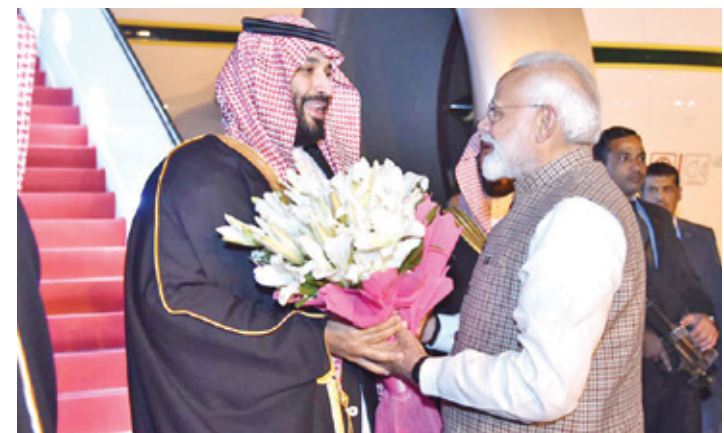
Modi receives Saudi Crown Prince in New Delhi.

"India is delighted to welcome HRH Mohammed Bin Salman, the