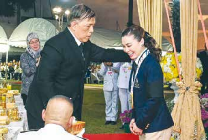
Thailand's King Maha Vajiralongkorn presenting the gold medal to Queen Suthida after her victory in the mixed keelboat SSL47 sailing event during the 33rd Southeast Asian Games (SEA Games) at the Ocean marina yacht club in Chonburi province.