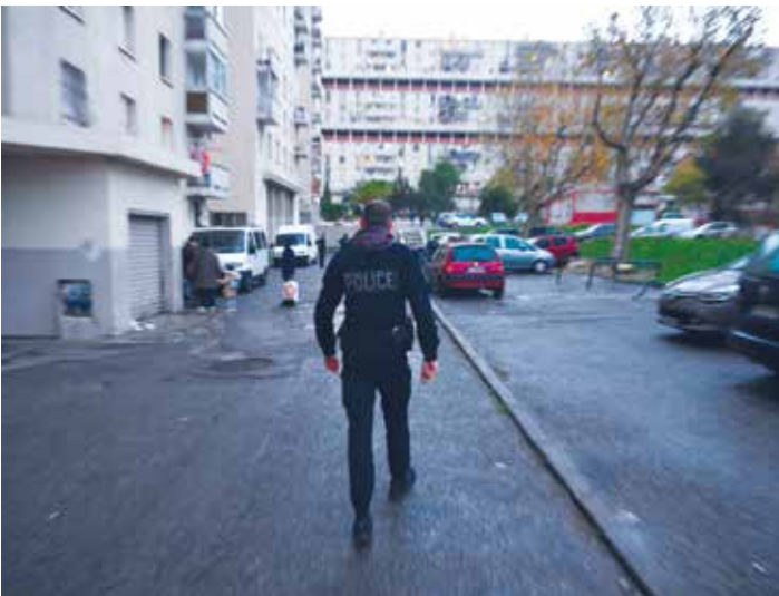
A police officer from the BST 14 Brigade, specialised in drug trafficking, walks through Les Rosiers housing project, in the northern districts of Marseille, southern France

He and another detainee had fled an overcrowded jail in the eastern city of Dijon after sawing through their cell bars with blades that investigators suspect