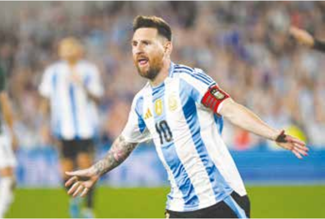
Argentina's forward #10 Lionel Messi celebrates after scoring during the 2026 FIFA World Cup South American qualifiers football match between Argentina and Bolivia at the Mas Monumental stadium in Buenos Aires

Spain, the European champions, and Argentina, the Copa America winners, will compete in the "Finalissima" international super final on March 27 in Qatar, the South American and European football confederations announced yesterday.