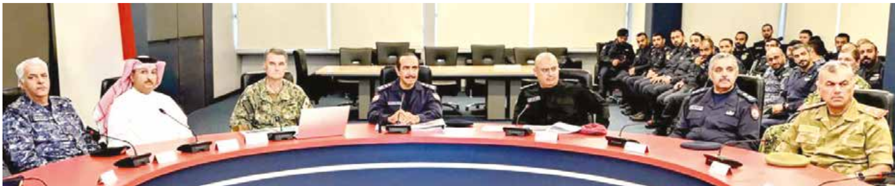
H.E. General Shaikh Rashid bin Abdullah Al Khalifa at the conclusion of joint maritime exercise

Interior Minister highlights importance of sea navigation protection at joint exercise