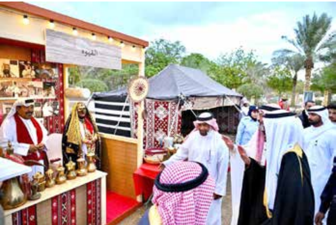
HH Shaikh Khalifa bin Ali Al Khalifa visits a stall