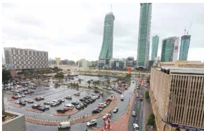
Chilly winds and rain make Bahrain’s roads wet and slippery

Durrat Al Bahrain reported 13 degrees (perceived 9), while the University of Bahrain recorded the lowest actual temperature at 12 degrees Celsius (perceived 9).