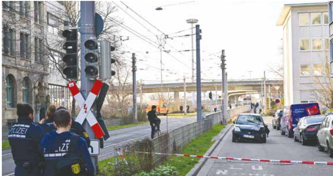
Police have cordoned off the scene of car ramming attack in Mannheim, southwestern Germany on March 3, 2025.

He had been suffering from a mental illness