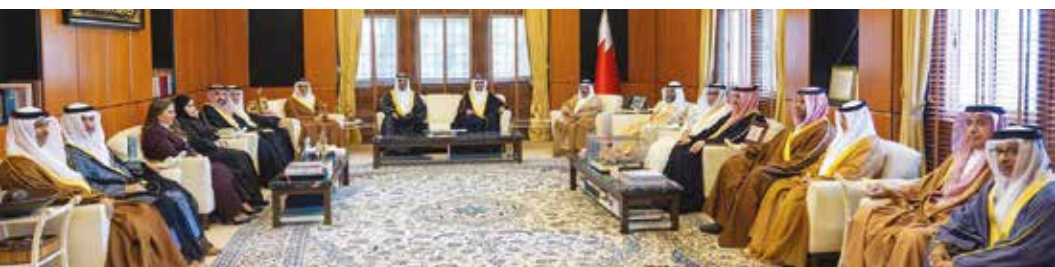
H.E. Shaikh Khalid bin Ahmed Al Khalifa with honourees.jpg

The Minister affirmed His Majesty's keenness to honour the nation's citizens for their valuable services to the King-