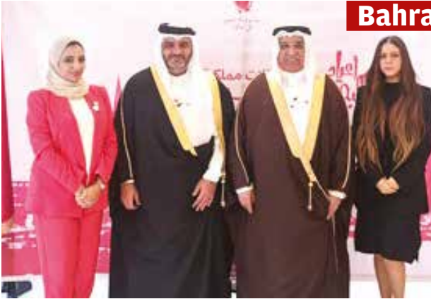
The Embassy of the Kingdom of Bahrain to the Republic of Indonesia hosted a reception to mark the Kingdom of Bahrain's celebration of its National Day and the 26th anniversary of His Majesty King Hamad bin Isa Al Khalifa's accession to the throne, along with the accompanying national events. H.E. Ahmed Abdullah Al Hajri, Ambassador of Bahrain to Indonesia, extended congratulations to His Majesty the King and to His Royal Highness Prince Salman bin Hamad Al Khalifa, the Crown Prince and Prime Minister, wishing the Kingdom continued progress and prosperity.