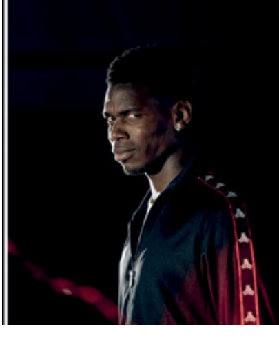
inho's sacking broke, posting Paul Pogba's now-deleted Instagram post

Over 64,000 people had 'liked' Pogba's cheeky message on Instagram