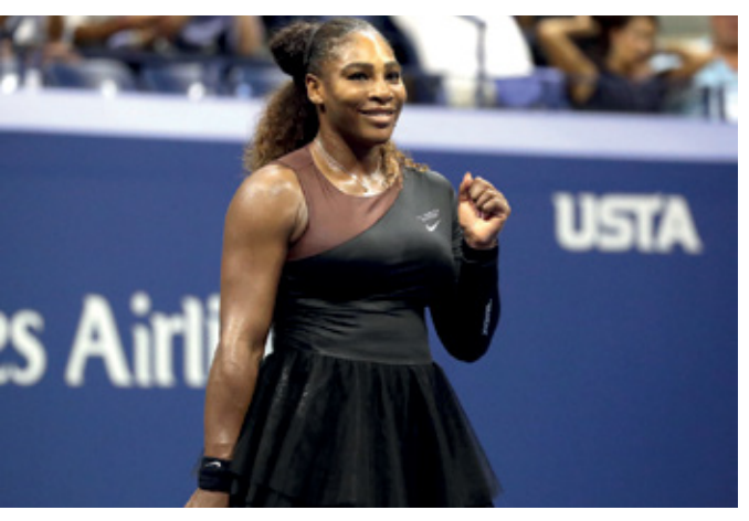
Serena Williams celebrates a winner (file photo)

For players who would qualaction after giving birth, was ify for a seeded position in the unseeded for some events and draw, the updated rule will caused an uproar with a black, ensure they will not face a seed skin-tight bodysuit she wore at in the opening rounds whether returning from pregnancy or