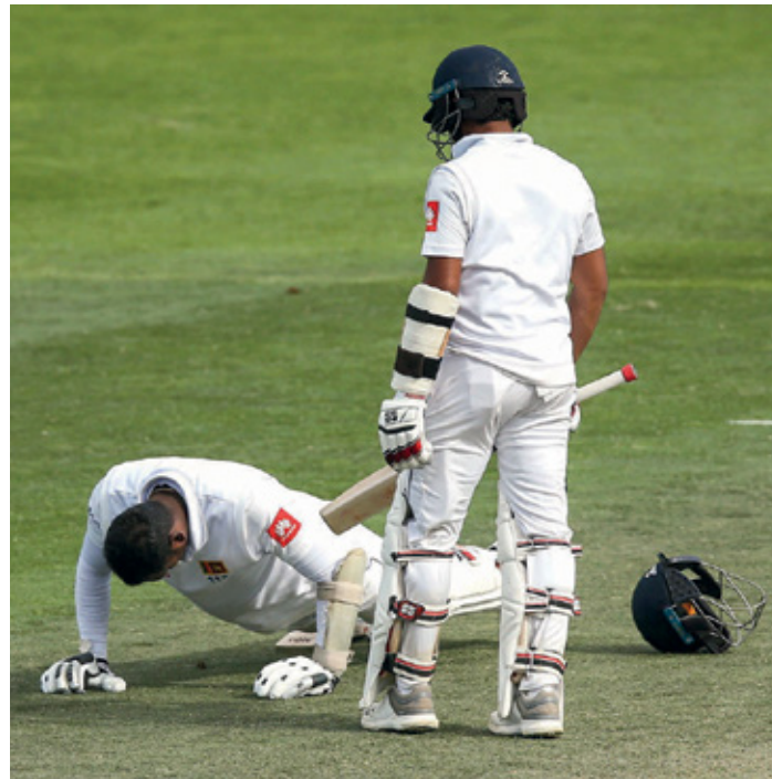
Angelo Mathews of Sri Lanka celebrates his century with a set of push-ups while Kusal Mendis looks on

The pair's epic vigil meant the tourists ended the day at 259 for three after starting in a seemingly hopeless position