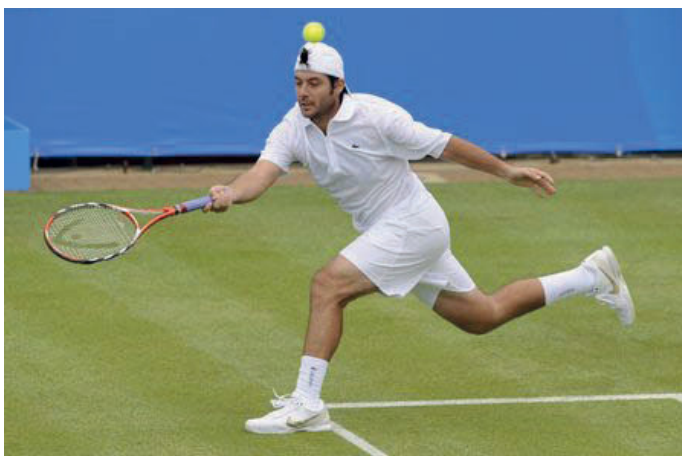
France's Sebastien Grosjean in action

"This post, which now has an Olympic dimension, promises to be exciting."