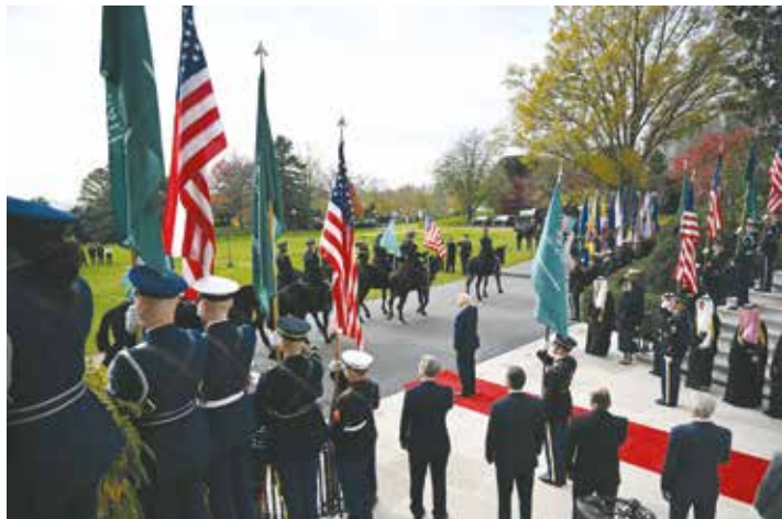
US President Donald Trump waits for the arrival of Crown Prince

tiano Ronaldo, who plays in Saudi Arabia, will also be at the White House for the gala day of events, a White House official