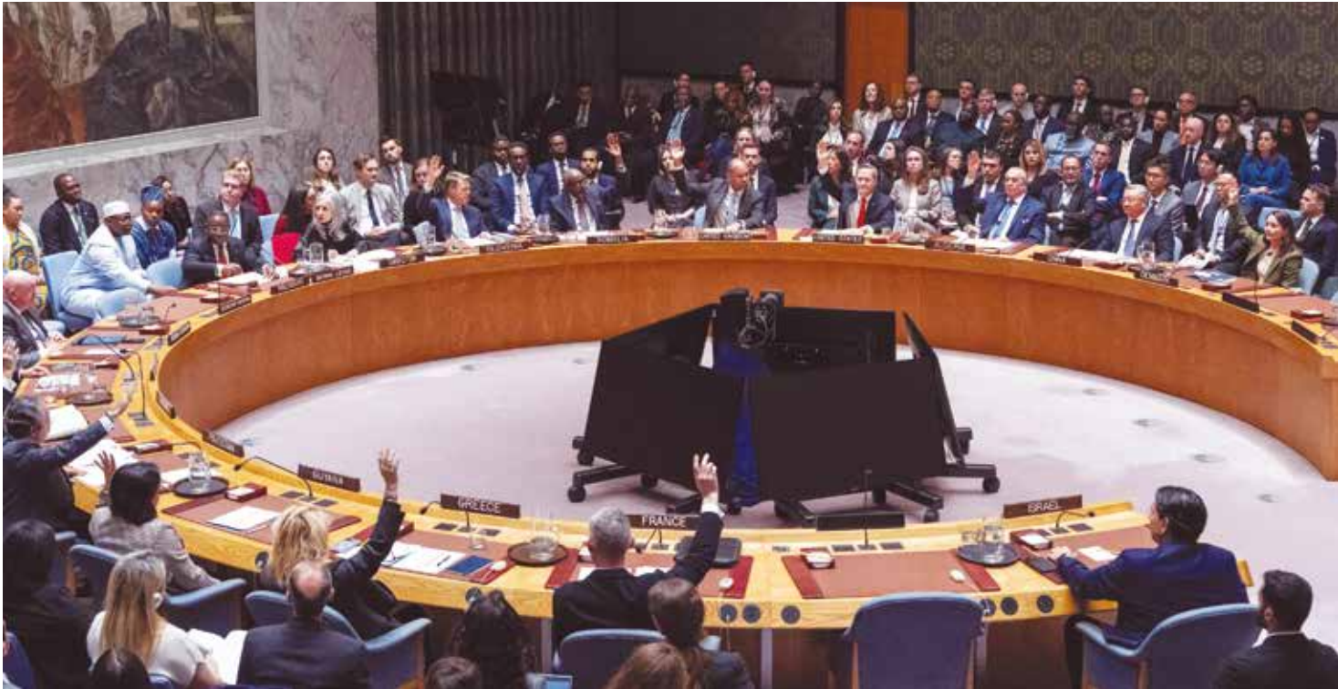
Members of the UN Security Council raise their hands to vote in favor of a draft resolution to authorize an International Stabilization Force in Gaza

Hamas rejected the resolution for the deployment of an international force