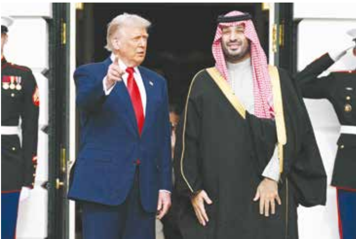
Trump greets Crown Prince and Prime Minister of the Kingdom of Saudi Arabia

Cannon fire and a parade of horses also greeted the Saudi prince as Trump doubles down on Washington's burgeoning