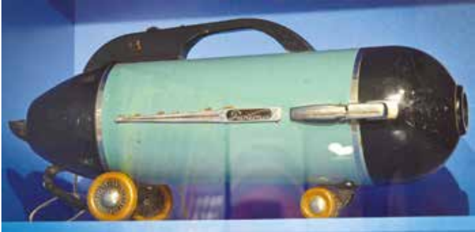
Electric vacuum cleaner "Rocket", 1956