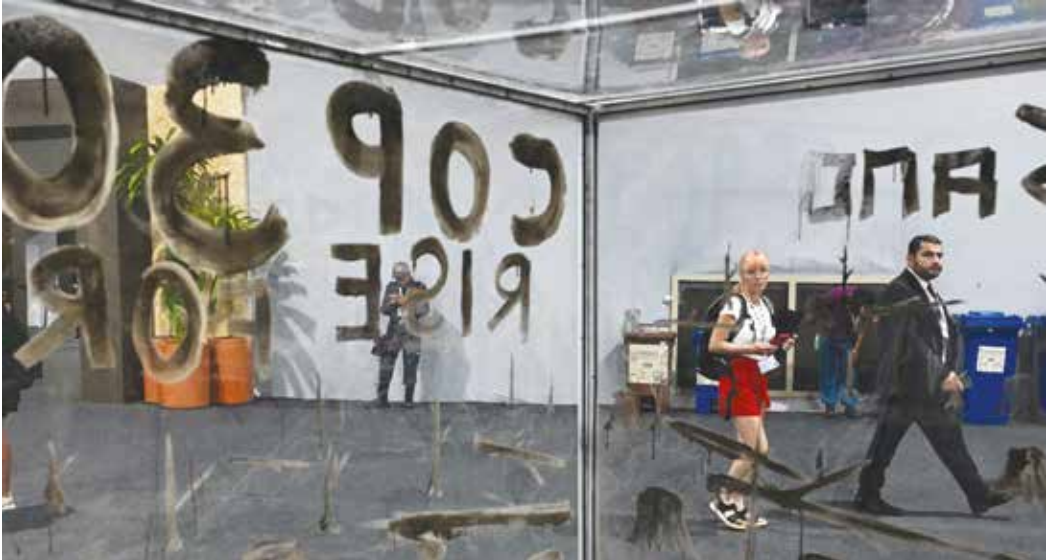
People walk past an installation by Brazilian artist Mundano, made for Greenpeace with ashes from Amazon forest fires, during the COP30 UN Climate Change Conference in Belem, Para state, Brazil,

The text leaves open a wide range of possibilities on the flashpoint issues in Belem --