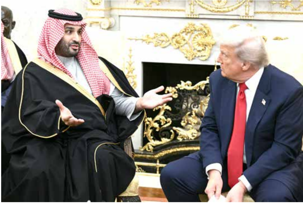
HRH Prince Mohammed speaks with US President Trump in the Oval Office of the White House.

now that the $600 billion will be $1 trillion?" a grinning Trump asked him to confirm the figure, to which the Saudi royal replied: "Definitely."