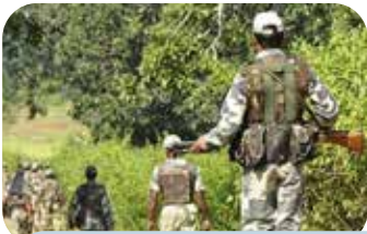
Indian police say Maoist leader of worst rebel massacre killed