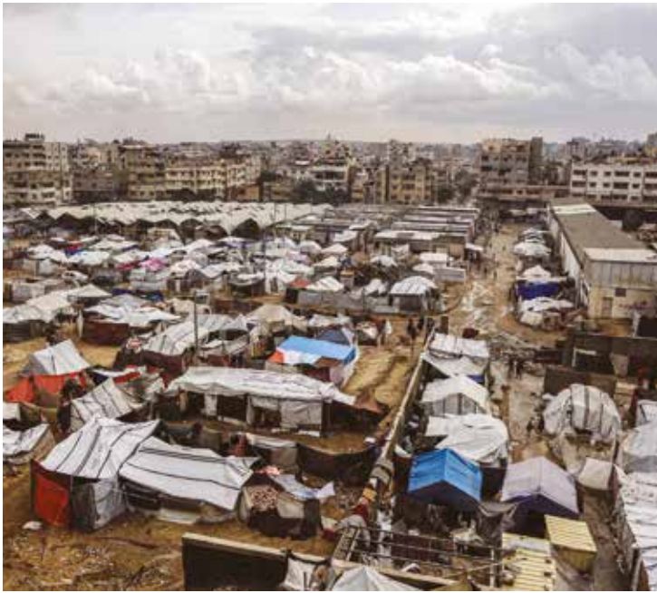
A displacement camp in Gaza City

Following the vote, Palestinians living in Gaza embraced a chance for life to improve, but had little faith that Israel would comply.