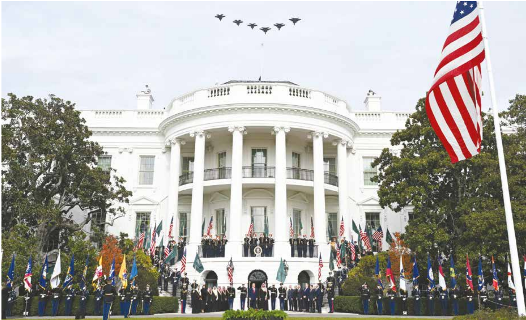
US President Donald Trump and Crown Prince and Prime Minister of the Kingdom of Saudi Arabia Mohammed bin Salman watch a flyover of military aircraft on the South Lawn at the White House in Washington, DC

Disclaimer: (Views expressed by columnists are personal and need not necessarily reflect our editorial stance)