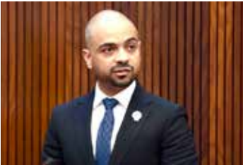
H.E. Osama Al Alawi

He also drew comparisons with the region, noting that Saudi Arabia and Kuwait apply a 4 per cent quota, Oman has raised its rate from 1 to 2 per cent and Qatar has a floor of 2 per cent in the private sector.