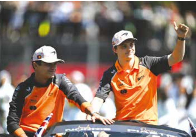
McLaren’s Australian driver Oscar Piastri (R) take part in the drivers’ parade ahead of the Mexico City Formula One Grand Prix