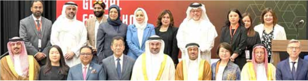
H.E. Abdullah bin Adel Fakhro, Minister of Industry and Commerce with distinguished guests