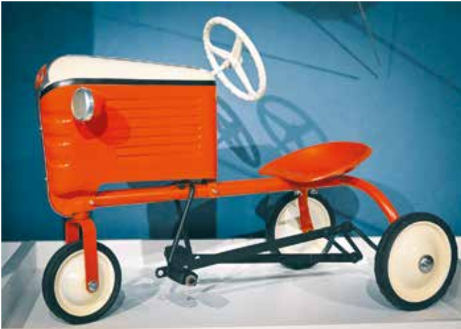
Three-wheeled pedal tractor toy, 1969