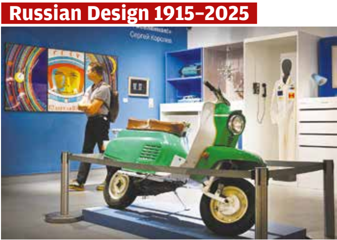
A man inspects "Russian Design 1915-2025" exhibition in the new building of the Tretyakov Gallery in Moscow. The exhibition spans 110 years, beginning with the legendary "Last Futurist Exhibition 0.10," held in St. Petersburg in 1915. It featured iconic works such as Kazimir Malevich's "Black Square" and Vladimir Tatlin's "Corner Counter-Relief," which became the starting point for Suprematism and Constructivism. These movements not only defined the face of Russian design but also influenced the entire world.

The marathon climate talks are supposed to end Friday after close to two weeks of negotiation, but they frequently run into overtime.