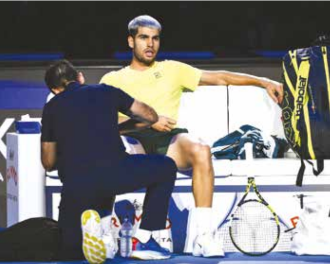
Spain's Carlos Alcaraz receives medical treatment during the men's single final match against Italy's Jannik Sinner