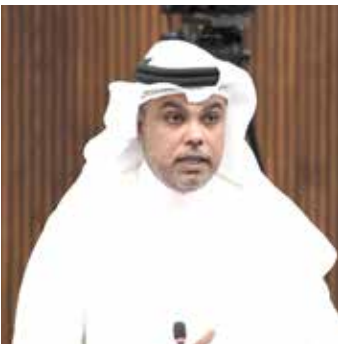
MP Mohammed Al Rifai

ready reviews private tenders from BD50,000 and government tenders from BD25,000.