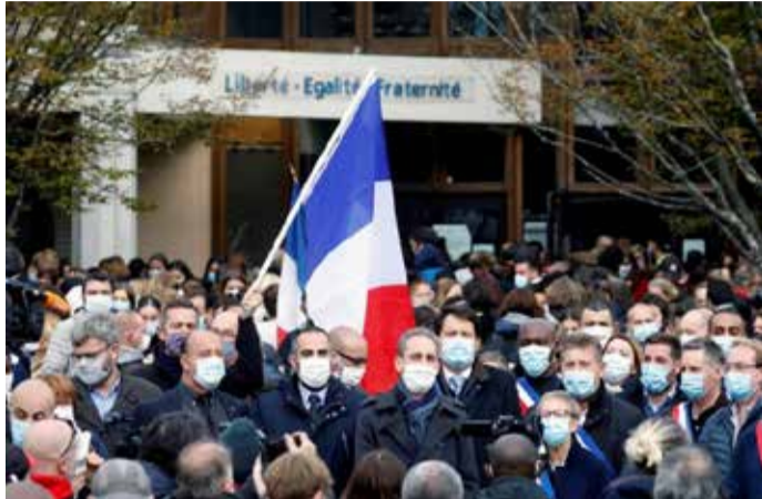
People gather in front of the Bois d'Aulne college after the attack in the Paris suburb of Conflans St Honorine, France