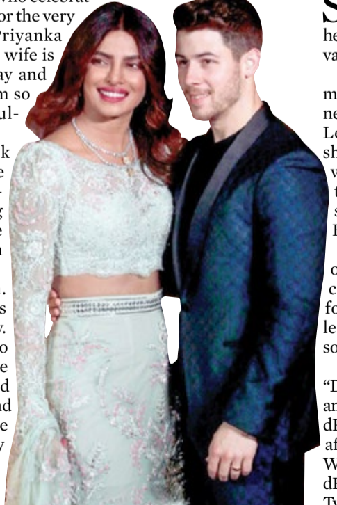
Priyanka Chopra Jonas and Nick Jonas

Singer Nick Jonas, who celebrated Karva Chauth for the very first time with Priyanka Chopra Jonas, says his wife is incredible in every way and that she has taught him so much about Indian culture and her religion. Nick on Friday took to Twitter, where he shared two photographs of himself along with Priyanka. In the image, the two are seen in Indian wear. "My wife is Indian. She is Hindu, and she is incredible in every way. She has taught me so much about her culture and religion. I love and admire her so much, and as you can see we have fun together. Happy Karva Chauth to everyone!" Nick captioned the image.