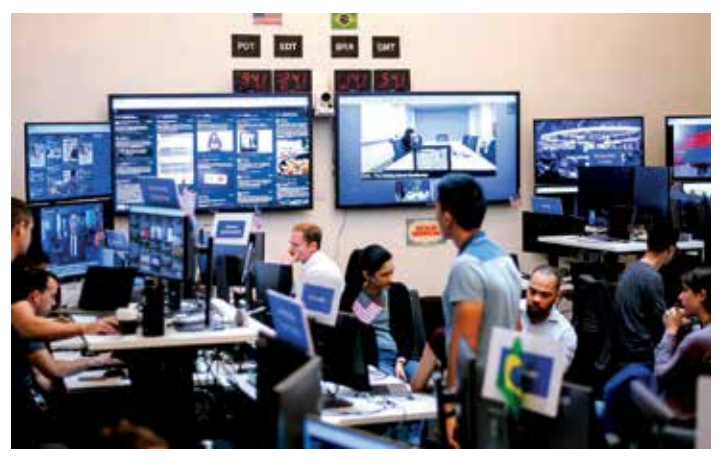
security policy director for the Employees work in Facebook's "War Room"

these actors." get measures in place and be-Facebook has been racing to gan operating this nerve center went viral.