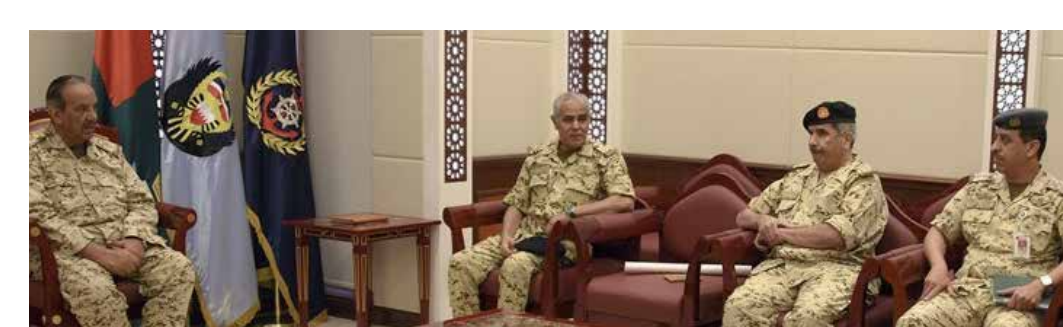
BDF Commander during a meeting held yesterday