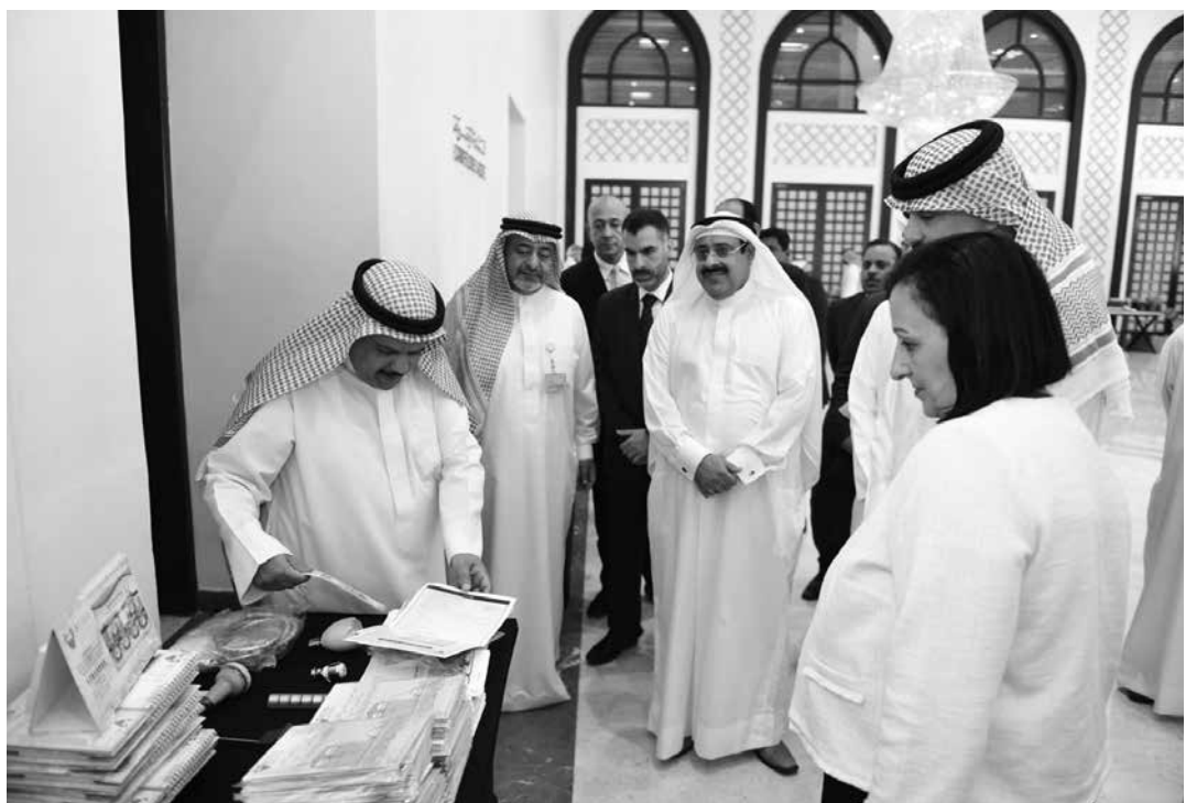
The move follows the EWA campaign's successful first phase which targeted 17 five-star hotels

The Gulf Hotel came first by recording a 27pc saving, followed by Downtown Rotana and the Crowne Plaza with 19pc and 14pc savings, respectively.