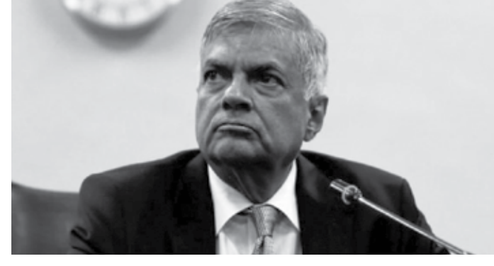
But the project was halted Sri Lankan Prime Minister Ranil Wickremesinghe (C) looks on at a news

their traditional type of dwell- worth 35.8 billion rupees ($210 ing instead of the concrete million) to be built by Indian given to firms which are ready structures the Chinese firm had firm ND Enterprises and two to build them at lower prices," Sri Lankan firms in the north Senaratne told reporters in Co-