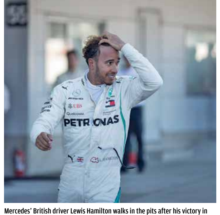
the Formula One Japanese Grand Prix at Suzuka

maximum 75 points remaining changes to his approach. after Texas, and will fancy his