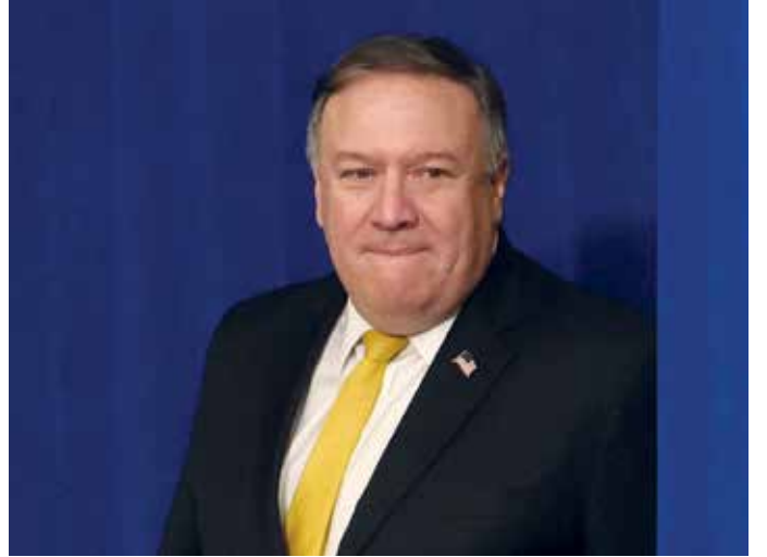
only major power without a spe- US Secretary of State Mike Pompeo (File photo)

between Washington and the them. Palestinians, but it came after a series of moves, including shut- our global efforts to improve the Gaza Strip," Pompeo said plan he has reportedly devised.