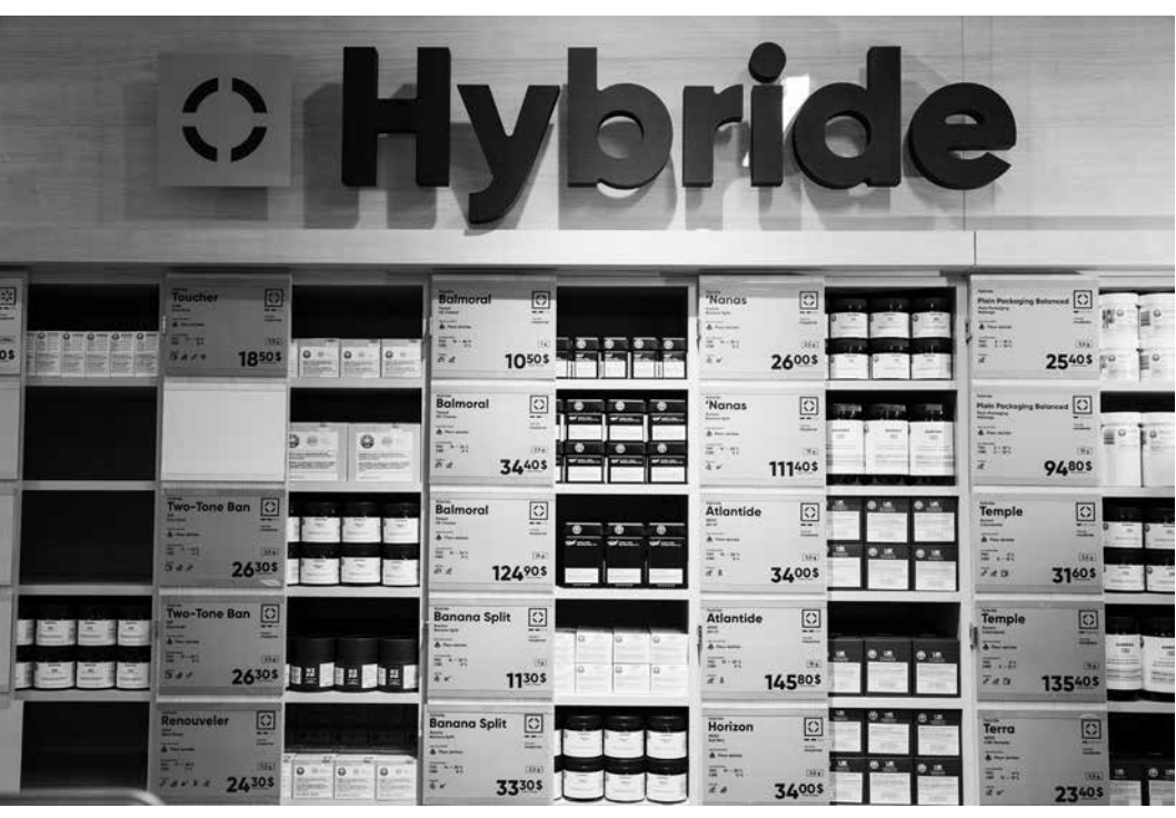
Cannabis items for sale are seen on October 16, 2018 in a Montreal cannabis store owned by the SQDC (Societe quebecoise

Legalization has sent stocks in pot companies soaring over the past year on the Toronto and New York stock exchanges (be-