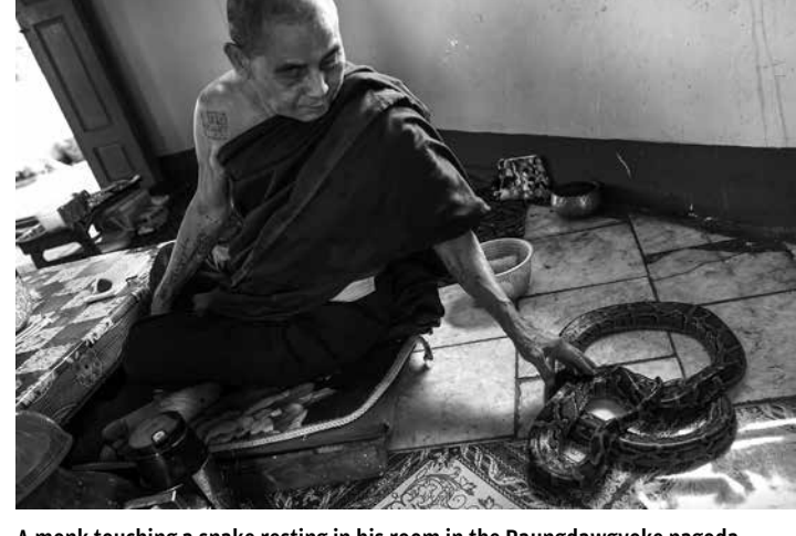
only ask for one thing, not many A monk touching a snake resting in his room in the Baungdawgyoke pagoda,

In the main room of the temple is a tree with figurines of branches, their forked tongues trating themselves.