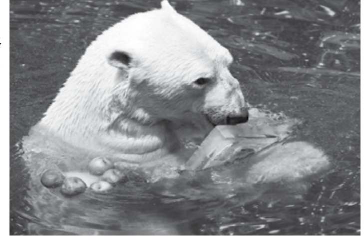
life Park next month to allow South Korea's last captive polar bear, a 23-year-old male named Tongki

The zoo had planned to move him to the Yorkshire Wildhim to enjoy his final days in of Phys.org)