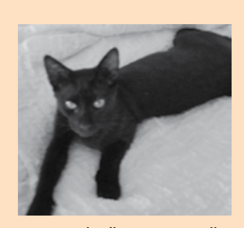
SOOTY - Male Dilmun, 7-8 mos, all glossy black with an extremely long tail, overweight now (older photo), neutered, microchipped, not wearing collar or ID tag, may have been taken, Riffa Views, 9/10/18.