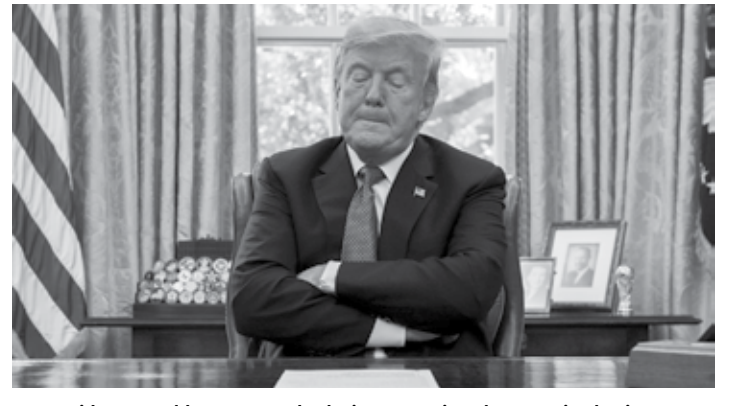
later than Jan. 1, 2020, said a US President Donald Trump speaks during a meeting about cutting business

The United States intends to exit the system of setting postal rates for smaller packages under the Universal Postal Union "as soon as practical" and no statement released by the White regulations in the Oval Office of the White House in Washington