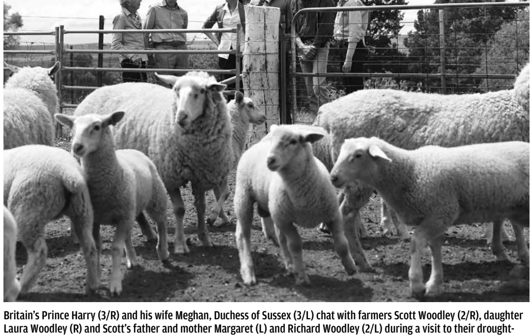
affected farm called Mountain View

The loved-up husband and made by a five-year-old boy, who wife mostly mingled with the was wearing his favourite pilot crowd separately, but when they