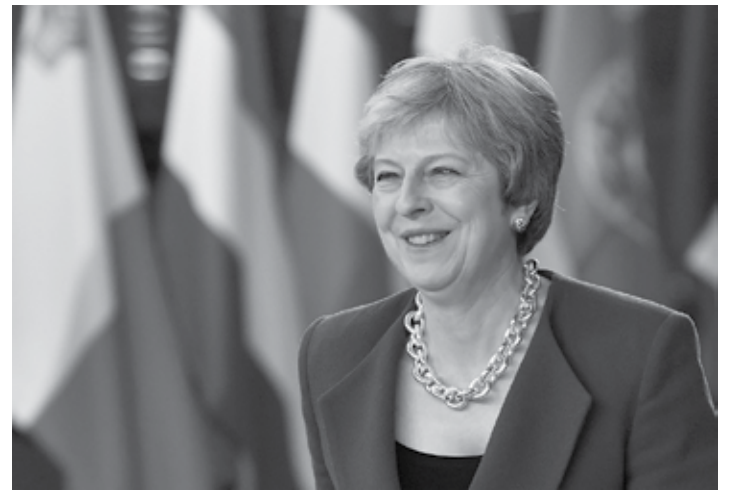
Britain's Prime Minister Theresa May arrives at the European Council in Brussels

Shanghai dived almost three of worries, including over global percent to a four-year low as trade wars, high oil price, Brexit already-strained relations beuncertainty and Italy's ongoing tween China and the US took another hit after the White House Brexit transition extension? London, Frankfurt and Paris said it plans to withdraw from all closed the day lower, after an international treaty on post-"sipping on a Brexit/trade war/ al rates, in a decision aimed at ister Theresa May said Britain EU negotiator Michel Barnier 2020 to be needed, amid anger Italian budget/US interest rates pressuring Beijing.