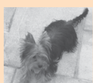
FLASH - Male Yorkshire Terrier, 2 years, microchipped (done in Ukraine), very friendly, ran out gate, wearing collar w name and driver mobile number, Awali, 11/7/18. WhatsApp or SMS 39966666