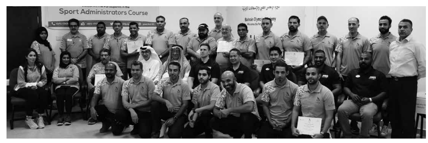
The participants with course officials during a photo session