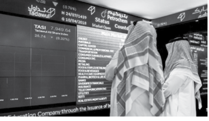
Traders watching stock movements on the floor of Saudi Stock market

per cent lower. Falling stocks ing added 2.2pc after winning a soared on SODIC's plan for a outnumbered gainers by 109 to project worth 23.1 million rivals merger via share swap, fell back 60, but a further drop in trading ($6.2 million) from the General 3.8pc and SODIC shed 3.2pc.