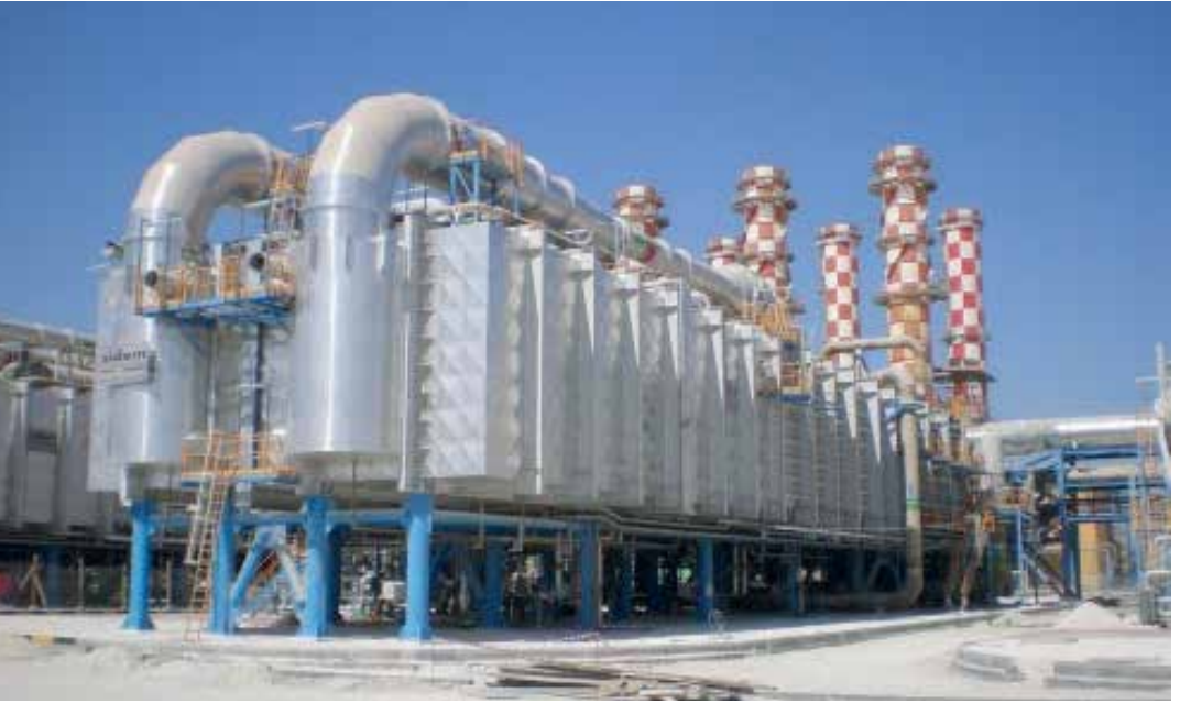
A desalination plant in Al-Hidd

a government document to a Climate Fund (GCF).