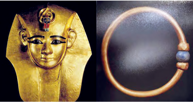
AFP | Cairo, Egypt

Egyptian police said yesterday they arrested a museum employee and three alleged accomplices after a priceless ancient gold bracelet was stolen from Cairo's Egyptian Museum, sold for about $4,000 and then melted down. The 3,000-year-old bracelet, a gold band adorned with lapis lazuli beads, dated back to the reign of Amenemope, a pharaoh of Egypt's 21st Dynasty (1070-945 BC). The priceless artefact had been kept under lock and key when it disappeared, a few weeks before it was meant to be exhibited in Italy. Museum staff reported it missing from a metal safe in the museum's conservation lab on Saturday, a statement from Egypt's interior ministry said. Investigations showed a restoration specialist working at the museum stole the bracelet on September 9 while on duty. A silver trader in central Cairo helped her facilitate the sale, the police said, first to a gold dealer for 180,000 Egyptian pounds ($3,735),