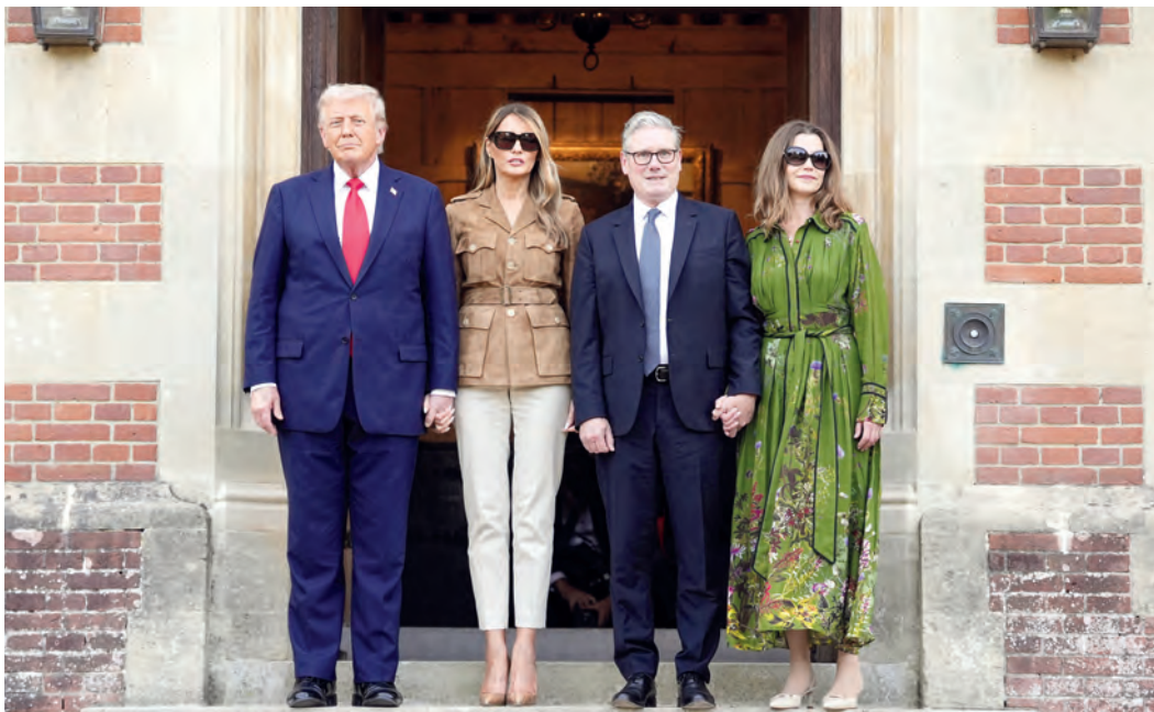
Britain's Prime Minister Keir Starmer (2R) and Victoria Starmer (R) bid farewell to US President Donald Trump (L) and US First Lady Melania Trump (2L) following their meeting at Chequers, in Aylesbury, central England

Referring to Starmer, Trump said "one of our few disagreements" was over the UK's plan to recognise a Palestinian state.