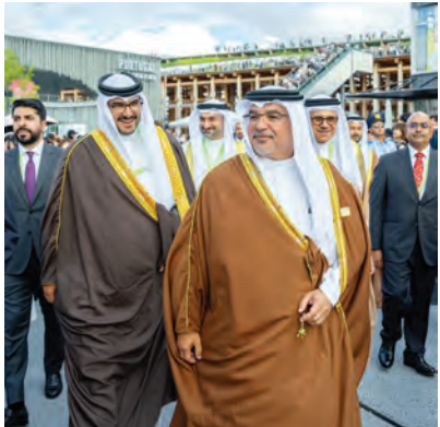
HRH the Crown Prince and Prime Minister attends the Kingdom of Bahrain's National Day celebrations at the Expo