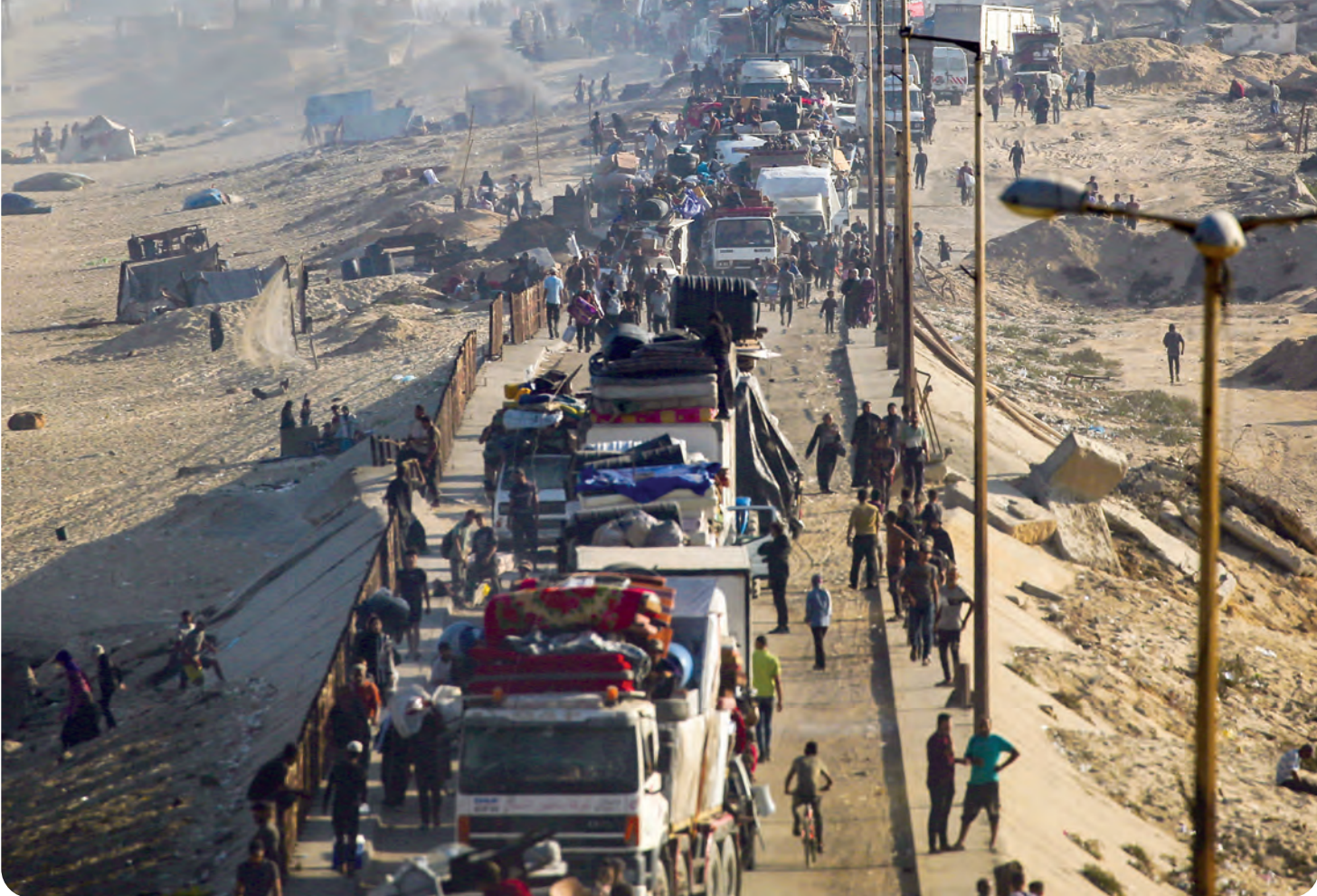
Displaced Palestinians move with their belongings southwards on a road in the Nuseirat refugee camp area in the central Gaza Strip following renewed Israeli evacuation orders for Gaza City

who then sold it to a worker at a gold foundry for 194,000 pounds ($4,025). The bracelet was then melted down along with other scrap gold, the ministry said. The suspects were taken into custody and confessed to the crime, according to authorities. Security camera footage released by Egyptian authorities shows a bracelet being exchanged for a wad of cash in a shop, before the buyer cuts it in two. However, the blurry images suggest the bracelet lacks the distinctive lapis lazuli bead seen in official photos shared a day earlier. Egyptian media outlets had earlier reported the loss was discovered during an inventory check ahead of the "Treasures of the Pharaohs" exhibition scheduled in Rome next month. Under Egyptian law, stealing an antiquity with the intent to smuggle it is punishable by life imprisonment and a fine of 1 to 5 million Egyptian pounds (around $20,000-$100,000), while damaging or defacing antiquities carries up to seven years in prison and a fine of up to 1 million pounds.