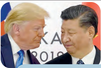
Trump says to speak to Xi about TikTok