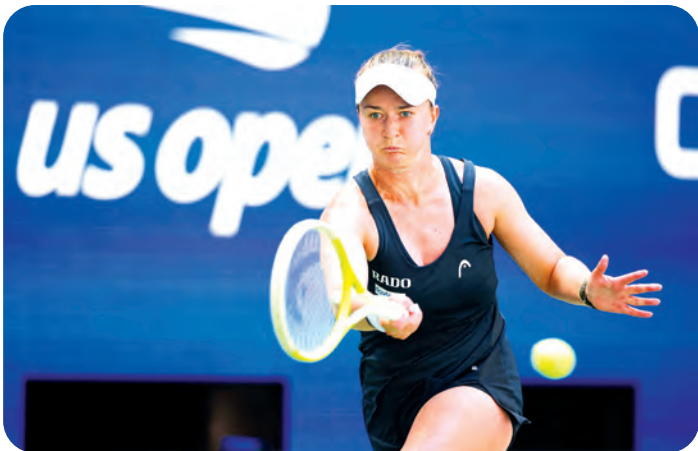
Barbora Krejcikova of Czechia

World number two Swiatek was stunned in straight sets by eventual finalist Amanda Anisimova in the last eight a fortnight ago at New York, where she triumphed in 2022.