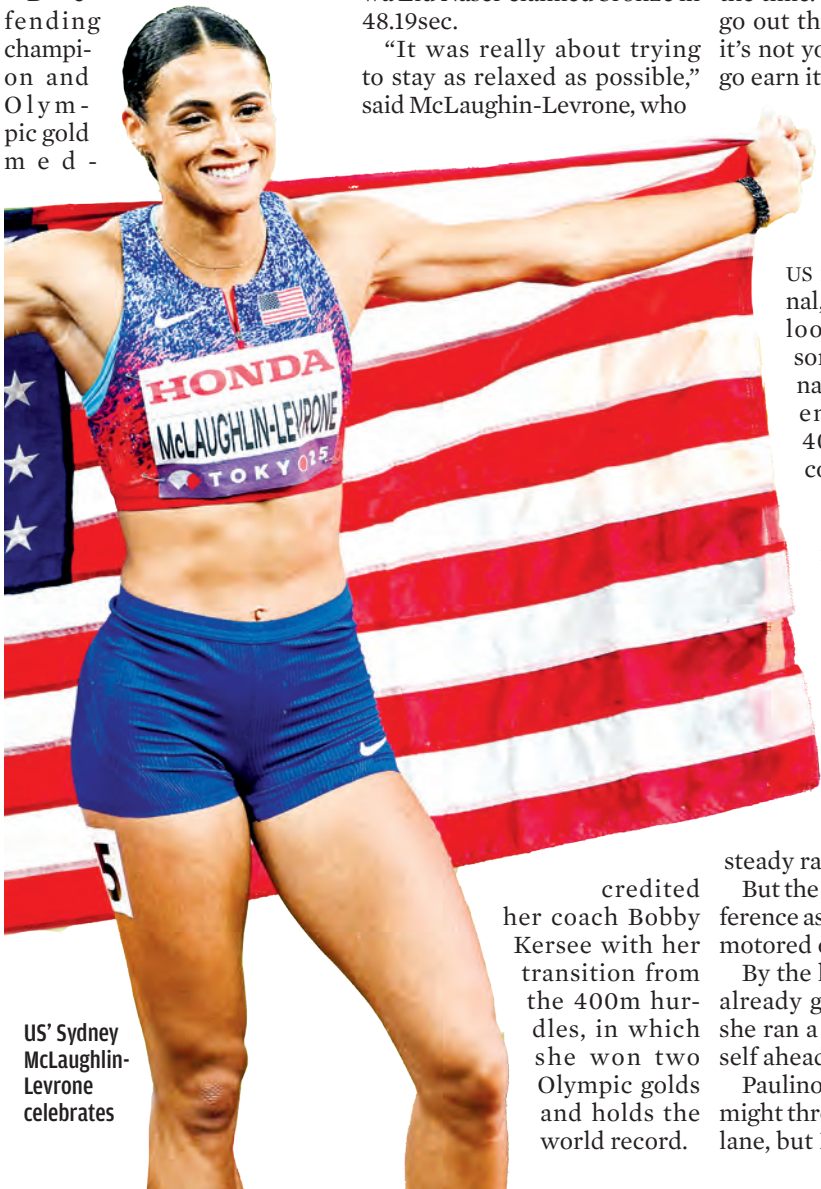
US’ Sydney McLaughlin-Levrone celebrates

US track star Sydney McLaughlin-Levrone ran the second fastest time ever to win a stunning gold in the women’s 400 metres at the world championships on Thursday. The 26-year-old American clocked 47.78sec on a rain-slicked Tokyo track to smash the previous championship record of 47.99sec set by Jarmila Kratochvilova of then-Czechoslovakia in 1983. Defending champion and Olympic gold medalist Marileidy Paulino took silver in a Dominican Republic record of 47.98sec -- the third fastest of all time. Bahrain’s Salwa Eid Naser claimed bronze in 48.19sec. “It was really about trying to stay as relaxed as possible,” said McLaughlin-Levrone, who