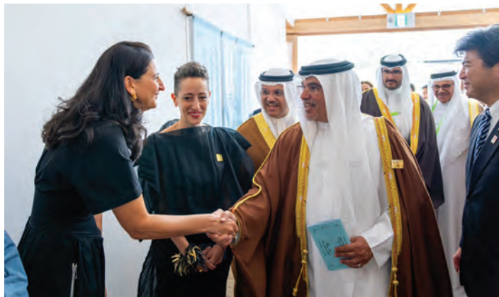
HRH Prince Salman receives a warm welcome upon arrival at the event's venue