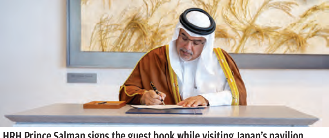
HRH Prince Salman signs the guest book while visiting Japan's pavilion