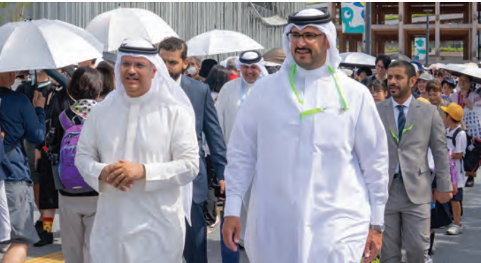
HH Shaikh Isa tours the pavilions

His Highness affirmed the significance of Expo as a prominent global platform that keeps pace with modern developments and offers extensive opportunities to explore innovative solutions