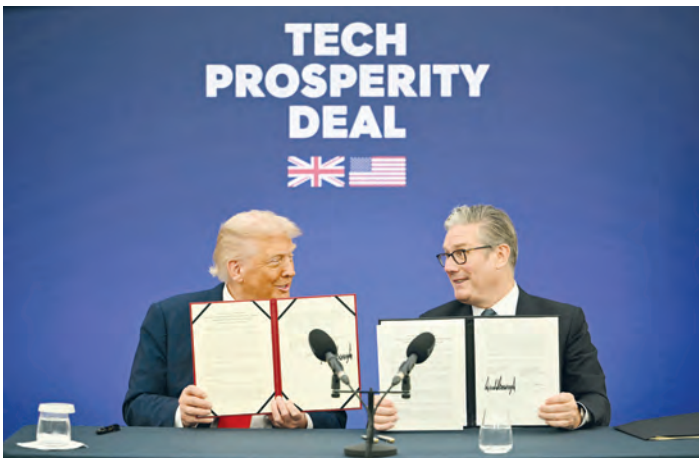
Britain's Prime Minister Keir Starmer (R) and US President Donald Trump (L) show off their signed technology prosperity deal

The US leader, embroiled in an immigration crackdown at home, offered his thoughts on immigration in Britain, revealing: "I told the prime minister I would stop it", even if it meant calling in the military.