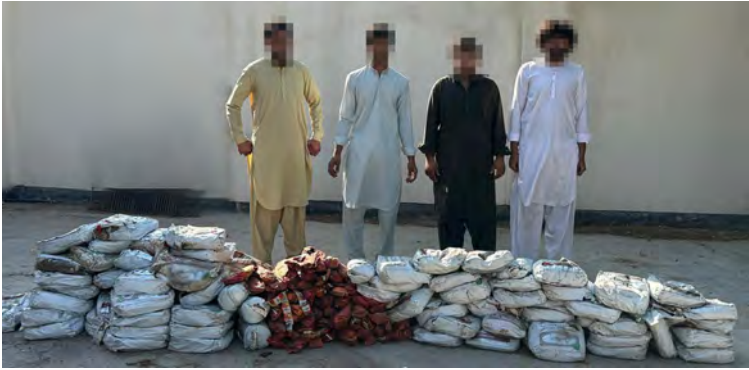
Suspects with seized evidence

Six held for violating residency conditions and selling banned tobacco and alcoholic beverages