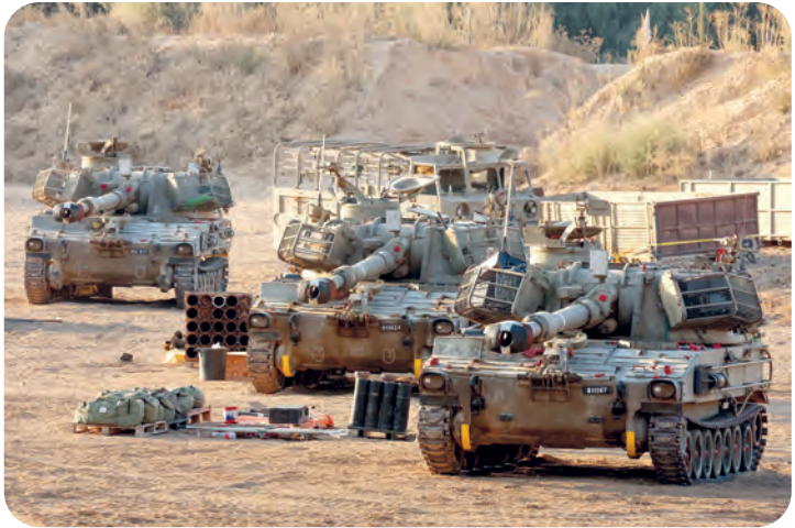
Israeli mobile artillery units deployed near the border fence with the besieged Palestinian territory

provided by the civil defence or the Israeli military. Hamas's armed wing, the Ezzedine al-Qassam Brigades, warned the military to expect fierce fighting. "We are ready to send the lives of your soldiers to hell, and we have prepared for you an army of martyrs," the group said in a statement. "Gaza will be a cemetery for your soldiers." Later on Thursday the Israeli military said four of its soldiers had been killed using an explosive device in Rafah, in southern Gaza. Meanwhile, a Jordanian driving an aid truck from Jordan to Gaza shot dead two Israelis at the Allenby crossing between the Israeli-occupied West Bank and the kingdom, both countries said. "This is the result of the echoing of Hamas's campaign of lies," the foreign ministry said on X. Jordan condemned the attack, saying it jeopardised the delivery of aid, with the Israeli military later calling for aid from Jordan to be halted. The US-backed offensive on Gaza City began on Tuesday and came as a United Nations probe accused Israel of committing "genocide" in the Gaza Strip, saying Prime Minister Benjamin Netanyahu and other senior officials had incited the crime.