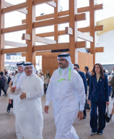
His Highness Shaikh Isa bin Salman bin Hamad Al Khalifa, Minister of the Prime Minister's Court, visits a number of pavilions