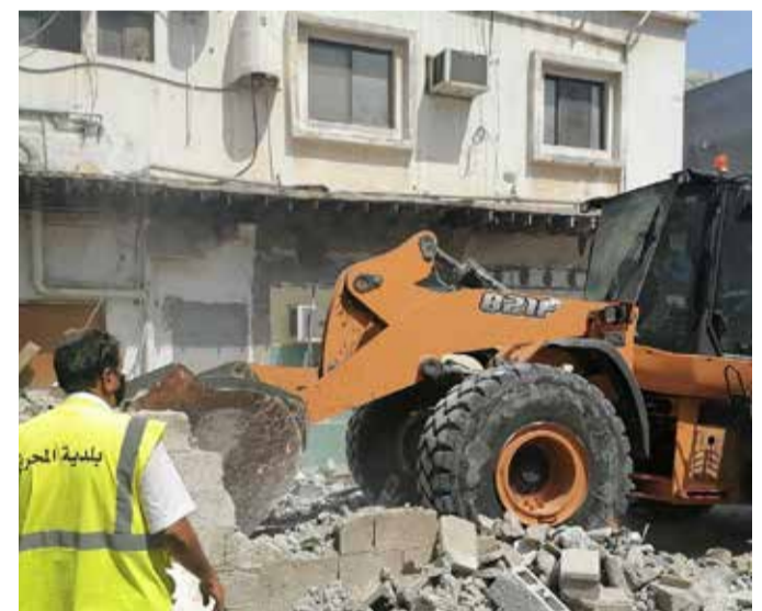
Municipal workers clearing encroachments