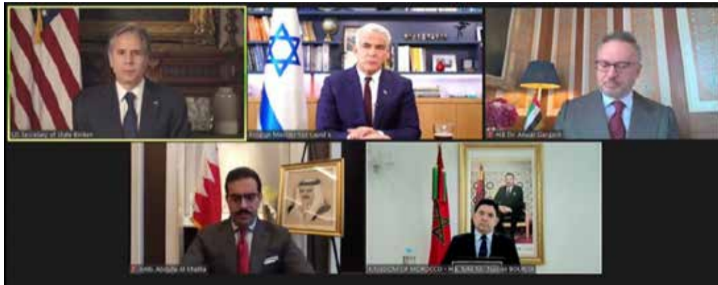
The virtual meeting on Abraham Accords anniversary