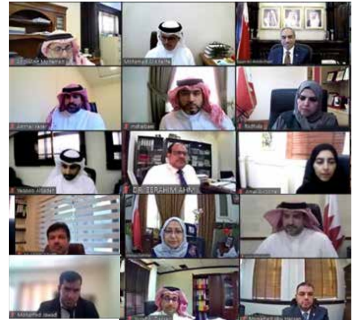
Works Minister during a meeting with officials