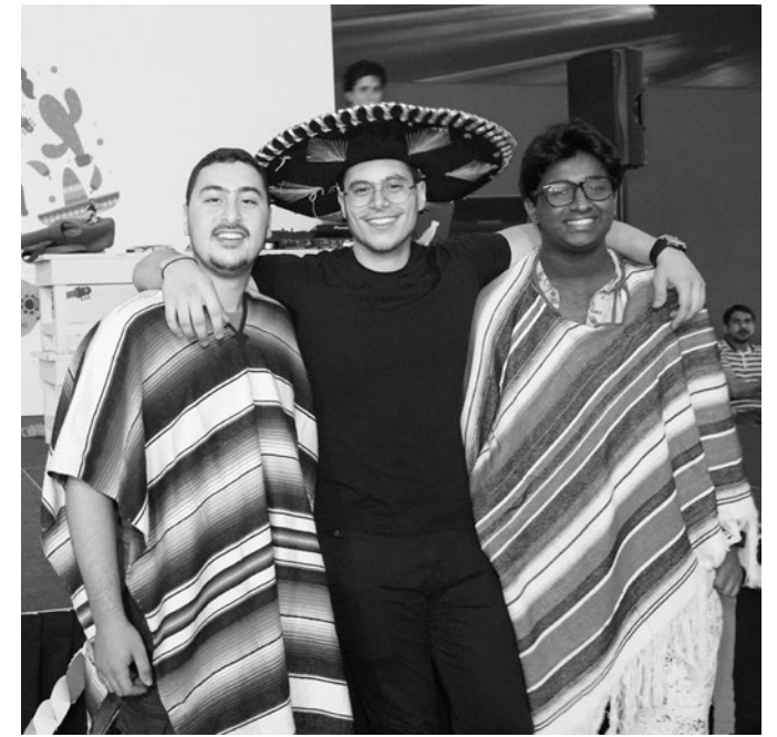
The Royal College of Surgeons in Ireland - Medical University of Bahrain (RCSI Bahrain) hosted its annual homecoming event under a 'Fiesta' theme with students turning out in Mexican inspired outfits at its campus in Busaiteen

It urged planning to perform contracts on its website www. islam.gov.bh or call the directorate during working hours on 17812854-17812868 - from 7 am until 2 pm.