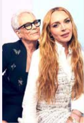
Lindsay Lohan and Jamie Lee Curtis