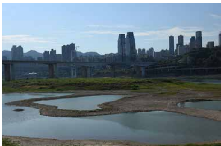
A view of the exposed riverbed of Yangtze river on a hot day in Chongqing, China

expanses of arable land. In the sprawling southwestern region of Chongqing, where most of Yangtze's Three Gorges reservoir is located, the grid is now scrambling to secure electricity from other parts of the country as supplies to industrial consumers are rationed, state media reported.