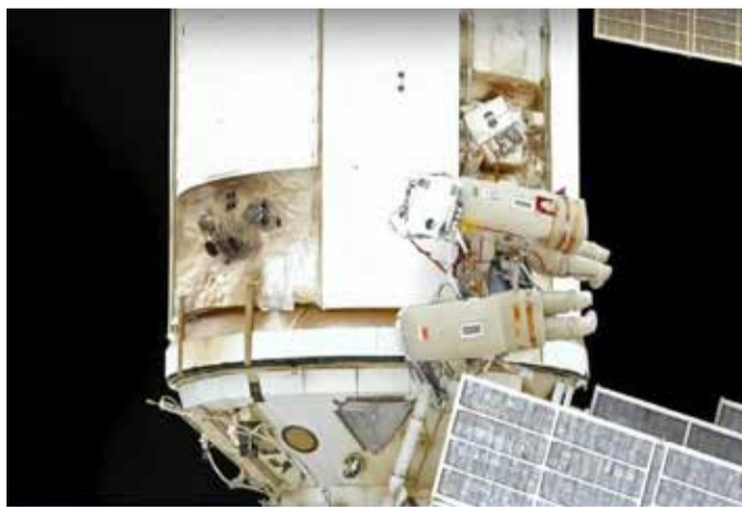
Roscosmos' cosmonauts Oleg Artemyev and Denis Matveev are seen during their spacewalk on the International Space Station

The cosmonauts managed to install cameras on the European Space Agency's new robot arm before the trouble cropped up, barely two hours into a planned 6 1/2-hour spacewalk