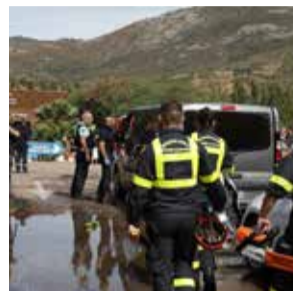
Rescue workers at a campground in Coggia, Corsica AFP | Washington

A violent and unexpected storm battered the French Mediterranean island of Corsica yesterday, killing at least five people including a teenage girl, and meteorologists predicted more bad weather to come.