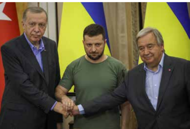
Ukrainian President Volodymyr Zelenskyy, Turkish President Tayyip Erdogan and UN Secretary-General Antonio Guterres shake hands after a joint news conference following their meeting in Lviv

Urges United Nations to ensure the security of Europe's largest nuclear power plant