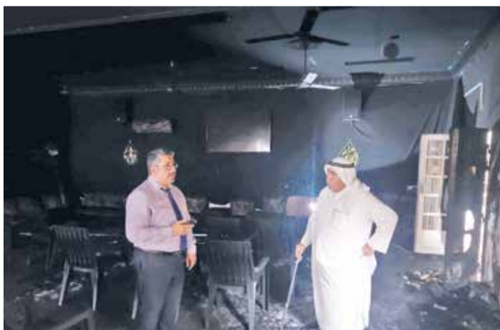
In pictures, Jaffari Endowments officials visiting the fire-hit building

Initial investigation suspects a short circuit from one of the air conditioners for the fire.