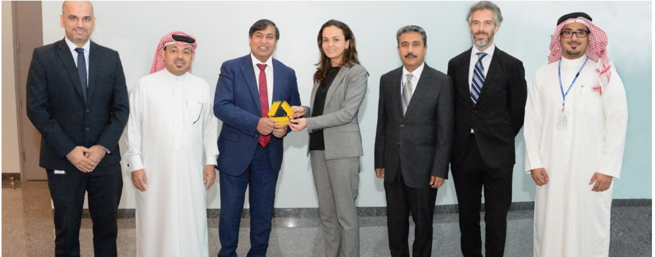
Promoted Gulf Air employees with top officials during a group photo opportunity