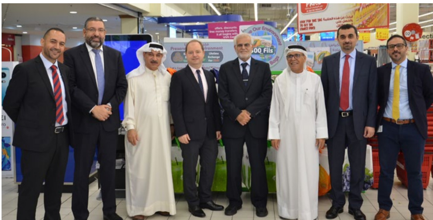
Officials of Carrefour, operated in Bahrain by Majid Al Futtaim, with representatives from the Northern Municipal Council

Hypermarket joins hands with Northern Municipal Council on Sustainability Goals