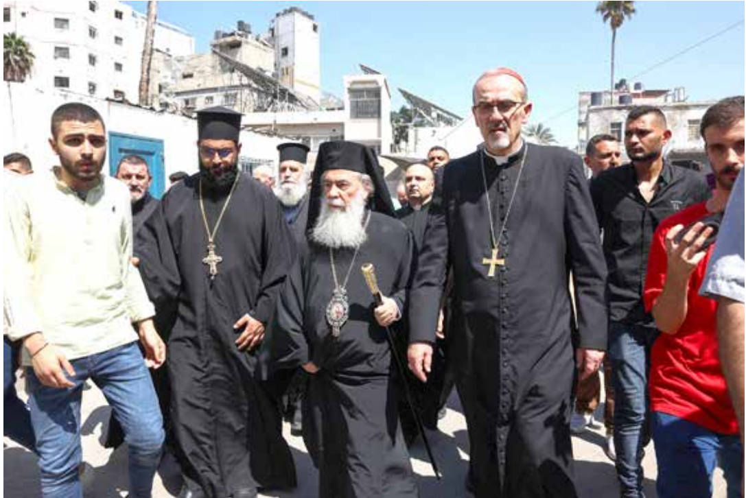
Greek Orthodox Patriarch of Jerusalem Theophilos III (C), Latin Patriarch of Jerusalem Pierbattista Pizzaballa (CR) and a delegation of top Christian clerics visit the Arab Ahli (Baptist) Hospital in Gaza City

They also said prayers and lit candles at the Greek Orthodox