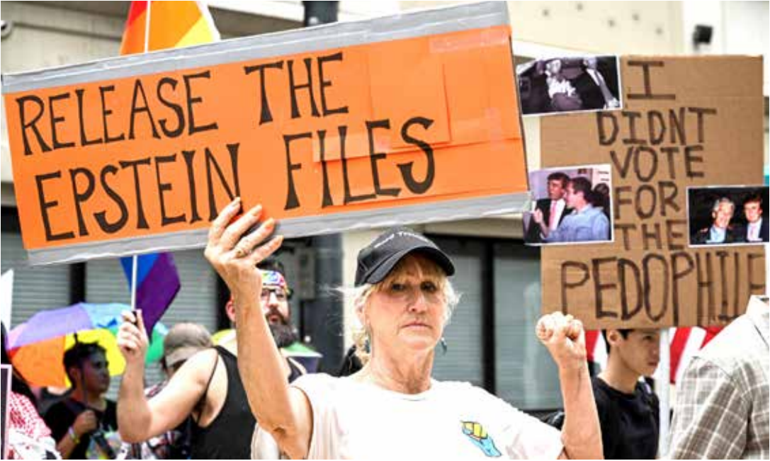
People holds signs calling for the release of files regarding late sex offender Jeffrey Epstein participate in a protest as part of the ‘Good Trouble Lives On’ national day of action against the administration of US President Donald Trump in Houston, TX

Attorney General Pam Bondi said the Justice Department would ask a court to unseal grand jury testimony from the case