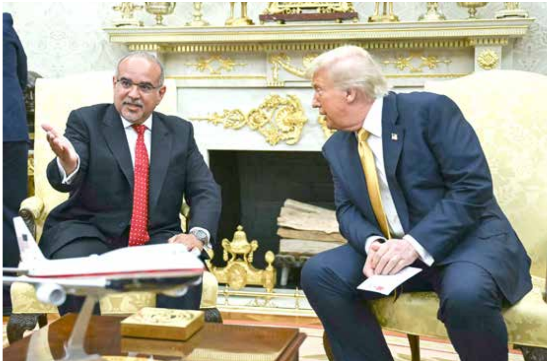
US President Donald Trump meets with HRH Prince Salman bin Hamad al-Khalifa in the Oval Office of the White House in Washington, DC

The United States, Bahrain, and the United Kingdom participated in a ceremony celebrating the UK joining the Comprehensive Security Integration and Prosperity Agreement (C-SIPA),