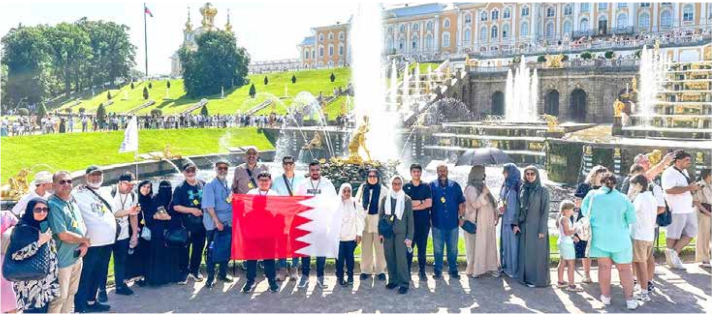
Bahraini families participating in the “Seasons” tourism initiative proudly raised the Kingdom’s flag at the historic Peterhof Palace in Saint Petersburg, Russia. They expressed pride and joy in representing Bahrain at one of the country’s most iconic landmarks, describing it as a moment they will long remember. Often referred to as the “Versailles of Russia,” Peterhof Palace was commissioned by Tsar Peter the Great in 1714 as a summer residence for the Russian emperors. Now a UNESCO World Heritage Site, it captivates visitors with its majestic architecture, sprawling gardens, and over 150 gravity-powered fountains.