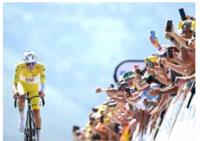
XRG team's Slovenian rider Tadej Pogacar wearing the overall leader's yellow jersey cycles to the finish line