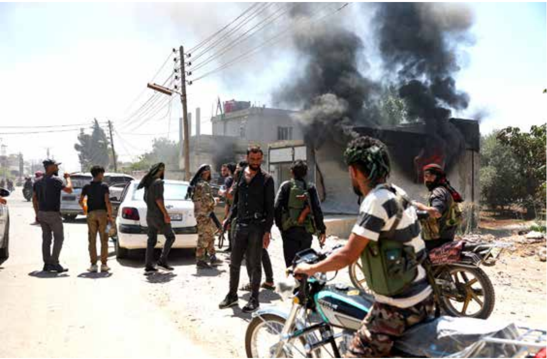
Fighters from Bedouin tribes gather near a burning building in al-Mazraa village, in Syria’s southern Sweida governorate, as clashes with Druze gunmen continue

Armed tribes clashed with Druze fighters in the community’s Sweida heartland yesterday, a day after the army withdrew under Israeli bombardment and diplomatic pressure. The United Nations called for an end to the “bloodshed” and demanded an “independent” investigation of the violence, which has claimed nearly 600 lives since Sunday, according to the Syrian Observatory for Human Rights. Interim President Ahmed al-Sharaa ordered government forces to pull out, saying that mediation by the United States and others had helped avert a “large-scale escalation” with Israel. Tribal reinforcements from across Syria gathered in villages around Sweida yesterday to reinforce local Bedouin, whose longstanding enmity towards the Druze erupted into violence last weekend. Anas al-Enad, a tribal chief from the central city of Hama, said he and his men had made the journey to the village of Walgha, northwest of Sweida, because “the Bedouin called for our help and we came to support them”. Homes and shops burned in the village, now under the control of the Bedouin and their allies. The Britain-based Observatory said “the deployment of tribal fighters to Sweida province was