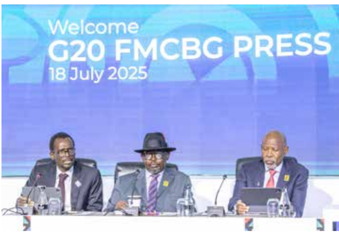
South Africa's Deputy Minister of Finance David Masedo (L), South Africa's Minister of Finance Enoch Godongwana (C) and South African Reserve Bank Governor Lesetja Kganyago (R) address the closing press conference on the last day of the G20 Finance Ministers and Central Bank Governors meeting at the Capital hotel, Zimbali in Durban

US Treasury Secretary Scott Bessent did not attend the two-