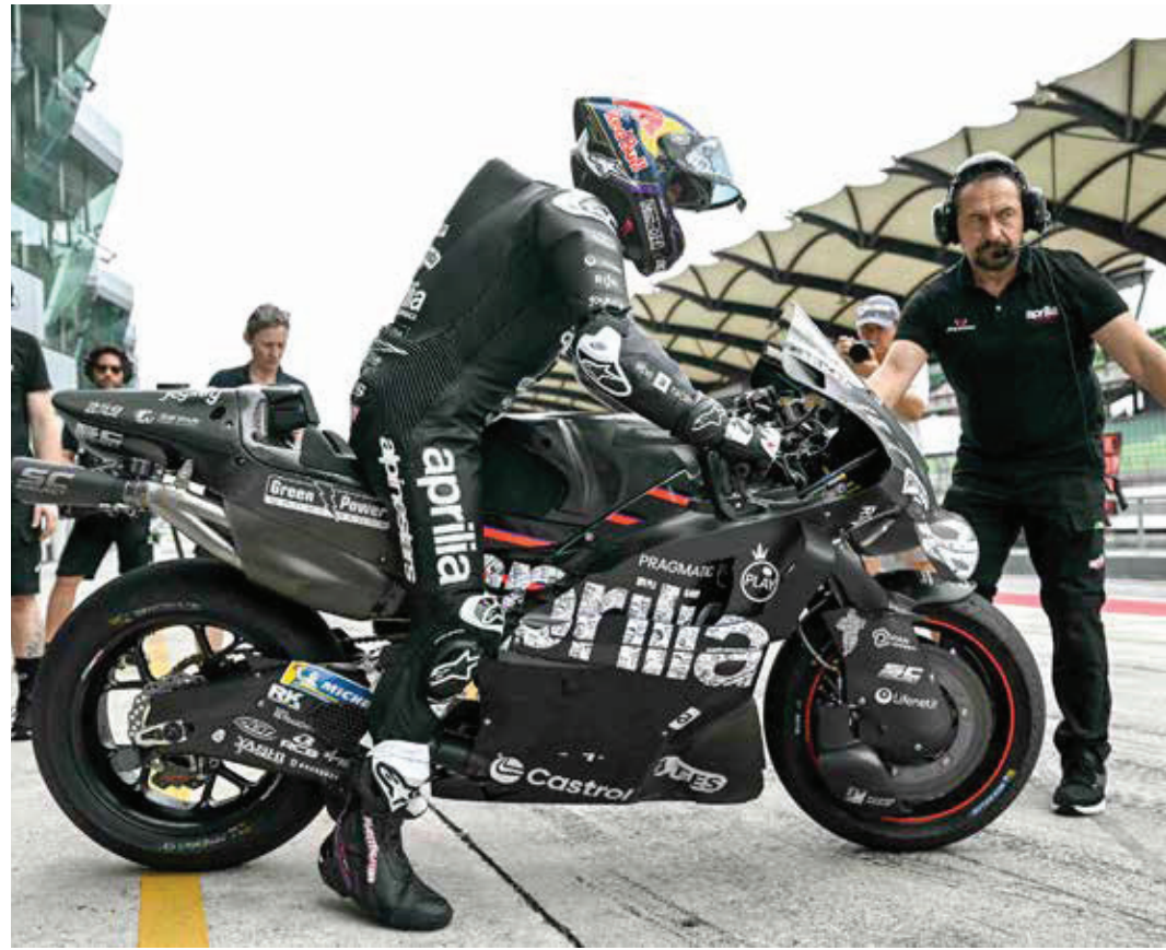
Aprilia Racing's Spanish rider Jorge Martin prepares to ride (file photo)

to work on my performance, and I feel I am a better and more prepared rider now," he added.