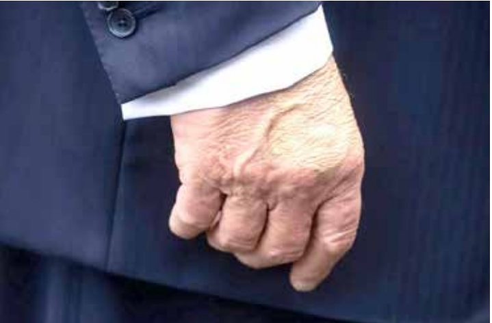
US President Donald Trump’s right hand is seen as he speaks to the press