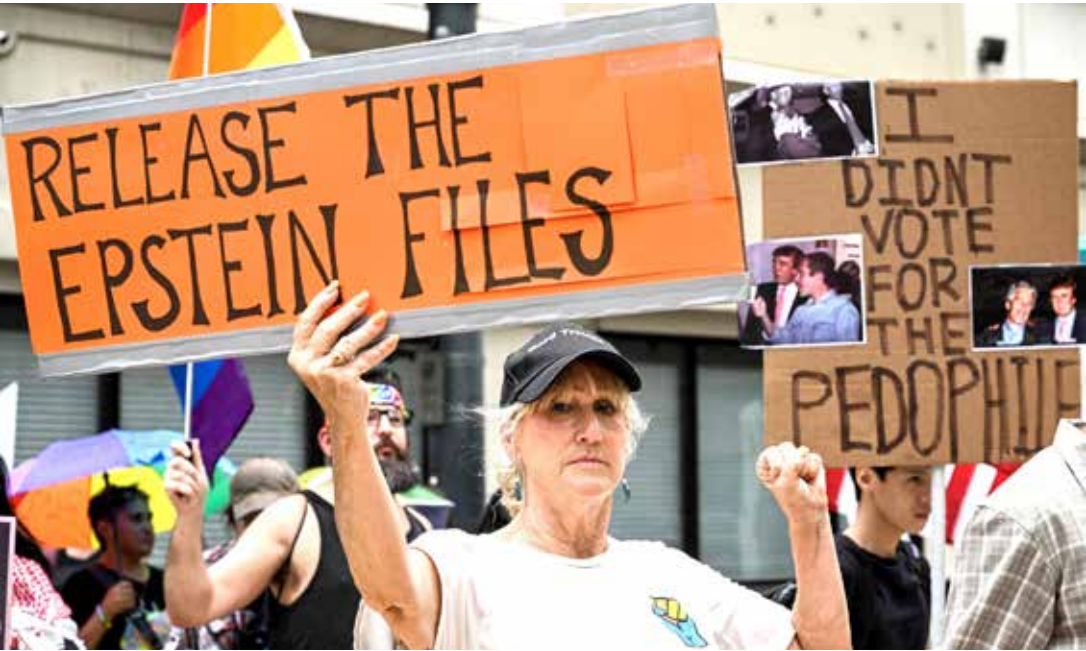
People holds signs calling for the release of files regarding late sex offender Jeffrey Epstein participate in a protest as part of the 'Good Trouble Lives On' national day of action against the administration of US President Donald Trump in Houston, TX

Attorney General Pam Bondi said the Justice Department would ask a court to unseal grand jury testimony from the case