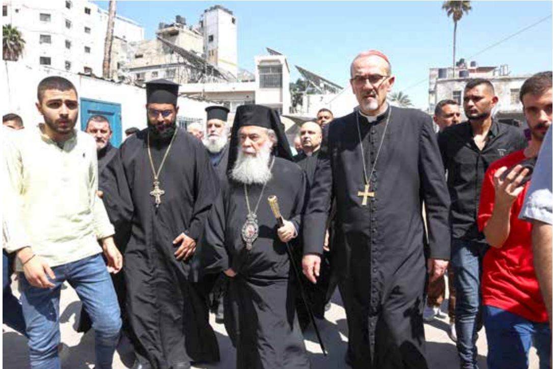
Greek Orthodox Patriarch of Jerusalem Theophilos III (C), Latin Patriarch of Jerusalem Pierbattista Pizzaballa (CR) and a delegation of top Christian clerics visit the Arab Ahli (Baptist) Hospital in Gaza City

They also said prayers and lit candles at the Greek Orthodox