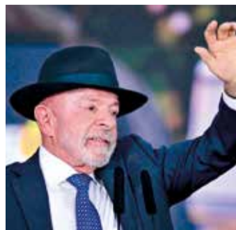
Luiz Inacio Lula da Silva

The five-time world champions were held to a 1-1 draw by Morocco in their opening match, which highlight-