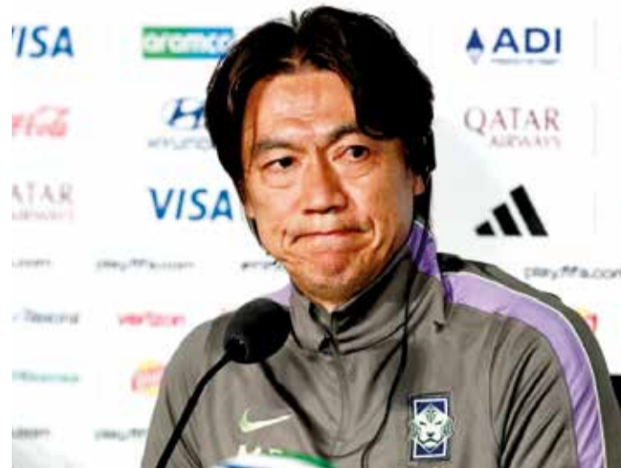
South Korea's head coach Hong Myung-bo

"Yesterday during our training there was a drone in the sky, and we came to know about the fact. But fortunately it was right before we practiced our tactics, so it did not impact us significantly," said the coach.