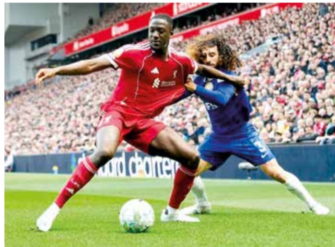
France centre-back Ibrahima Konate (L) and Spain left-back Marc Cucurella (R) in action during a match (file photo)