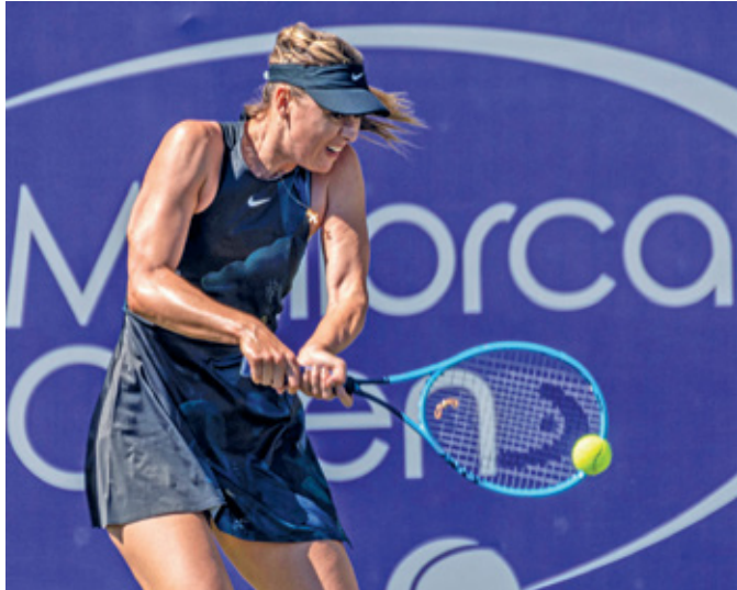
Maria Sharapova of Russia in action