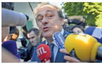
The former Uefa president Michel Platini talks to the press

and a statement from his representatives said the facts of the case were "unknown to him."