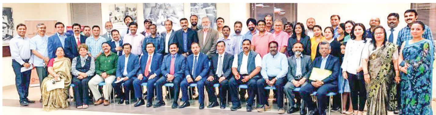
Members at the ICRF regional forum inaugural meeting.

numbers are increasing and all segments of community need to be well represented, especially the blue collar workers. The objective of this forum is to reach out to