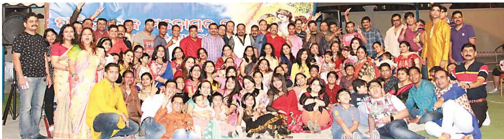
Members of Bahrain Odiya Samaj celebrated Raja Mauja 2018 with their families and children. Many fun-filled activities, musical shows and games for children were held as part of the event.