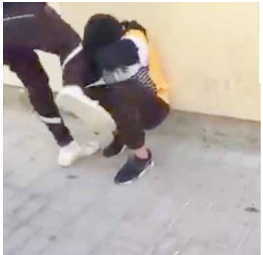
A screenshot of the video showing one of the attackers kicking the victim in his head.