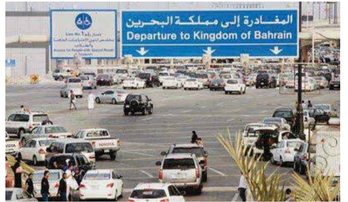
The border crossing on King Fahad Causeway.