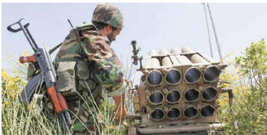
Both Qatar and Iran are accused of supporting Hizbollah

"Qataris are determined to strengthen the bilateral relations in all fields and I would personally observe the process of developing relations between the two cases," Tamin bin Hamad Al Thani was