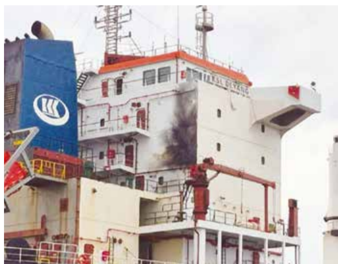
Aftermath of a Russian drone strike on a Chinese-owned cargo vessel in the Black Sea.