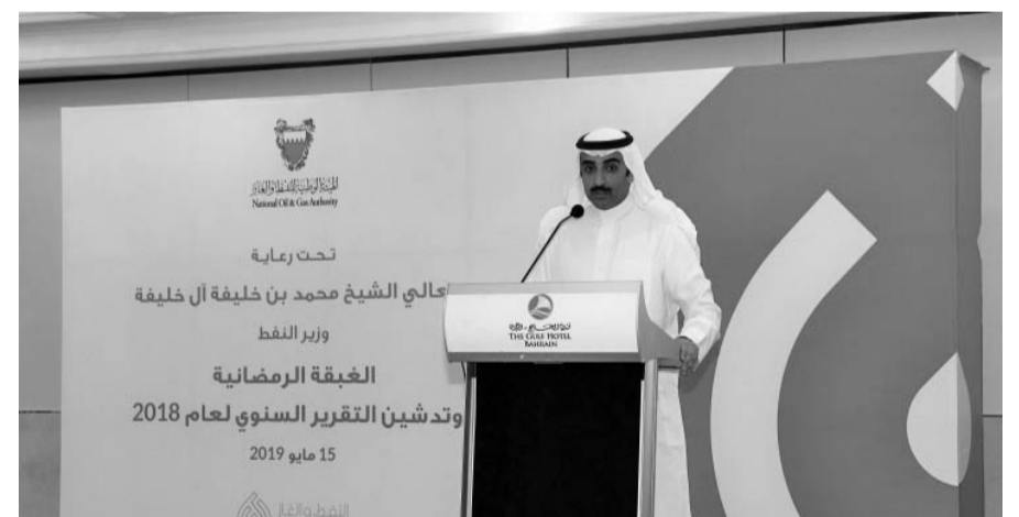
Oil Minister, Shaikh Mohammed bin Khalifa Al Khalifa, launching NOGA's Annual Electronic Report