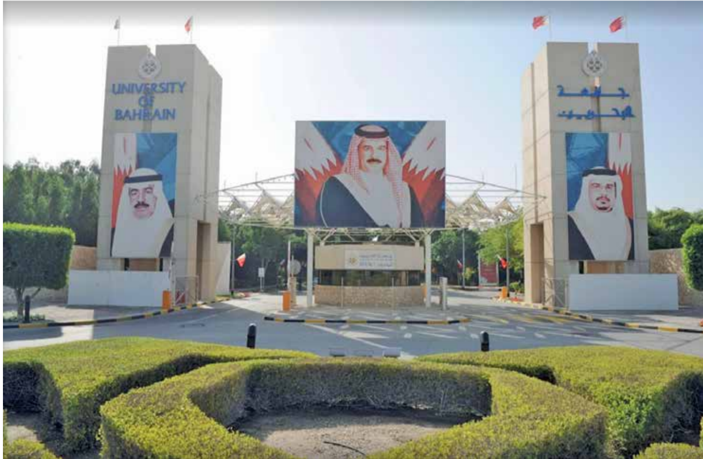
University of Bahrain.

If approved, Bahrain will soon have another top-class university, offering brand new courses that are not currently available in the other universities here, with the participation of the private sector