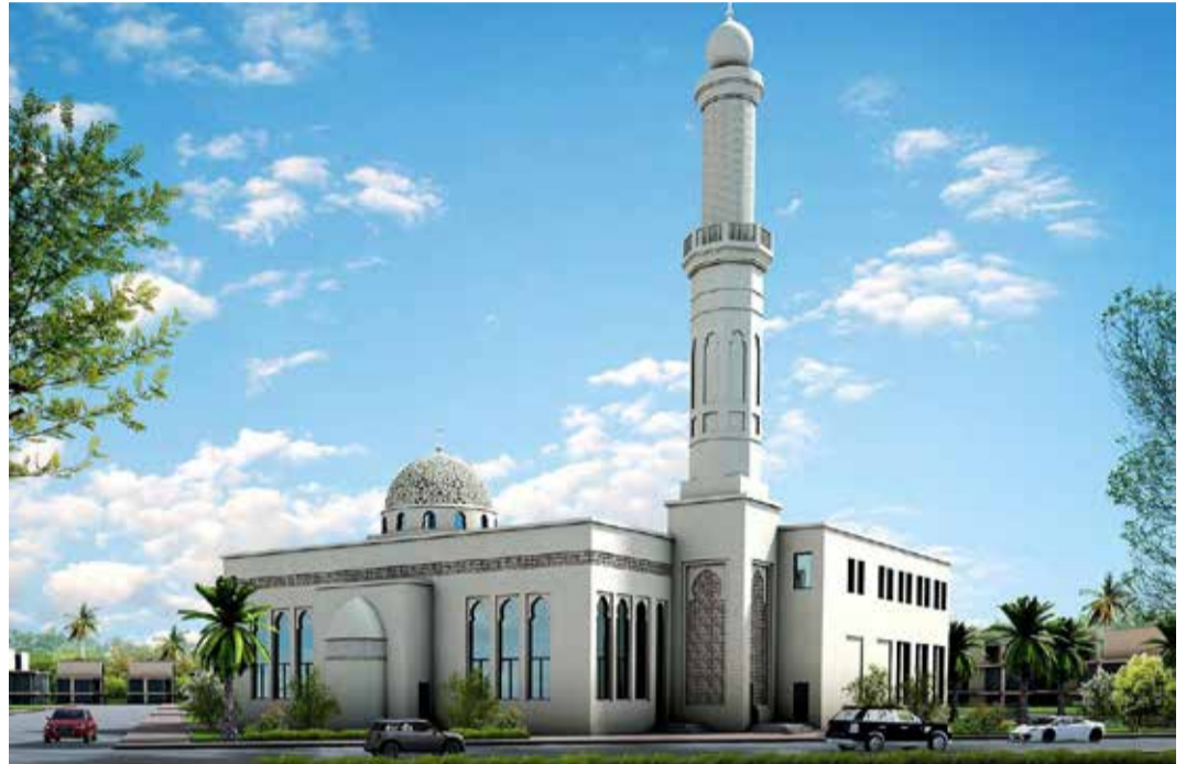
An artist's impression of the Khonji Mosque

serve more than 500 houses in the area, and its plan will include the establishment of a large yard for parking and a hall belonging to the mosque to hold social events.