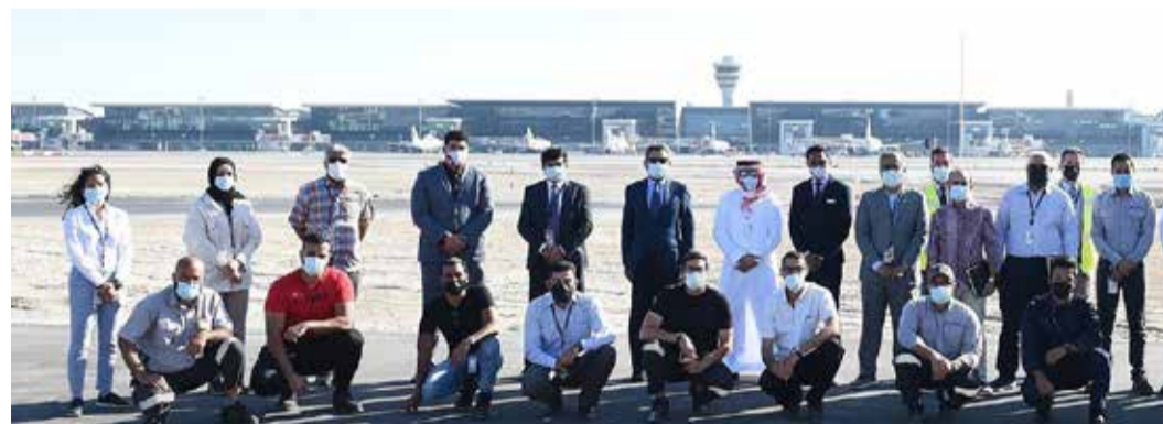
The training course participants with BAC and BASC officials

● BAC and BASC employees complete training programme