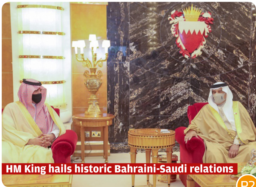
HM King hails historic Bahraini-Saudi relations