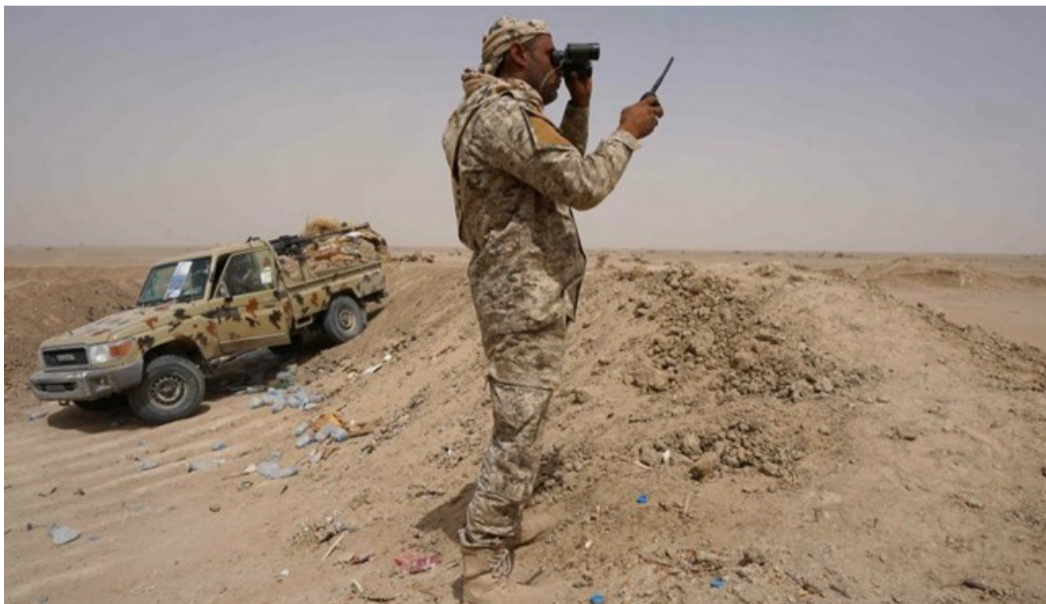
Yemen government forces hold a position against Houthi rebels in Marib

The attack on Marib stirred up violence in other areas, including government-held Taiz province, which is besieged by the Houthis. Clashes also took