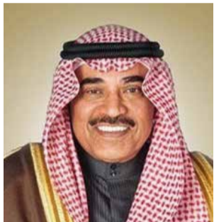
Kuwait Prime Minister