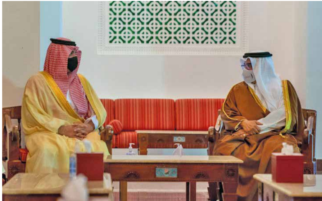
His Royal Highness Prince Salman bin Hamad Al Khalifa, the Crown Prince and Prime Minister, yesterday received the Saudi Minister of Interior, HRH Prince Abdulaziz. Later, HRH Prince Salman hosted an Iftar banquet in honour of HRH the Minister of Interior and his accompanying delegation.