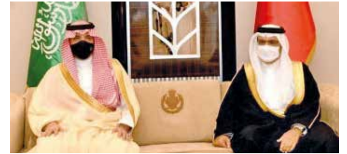
General Shaikh Rashid with the Saudi Interior Minister