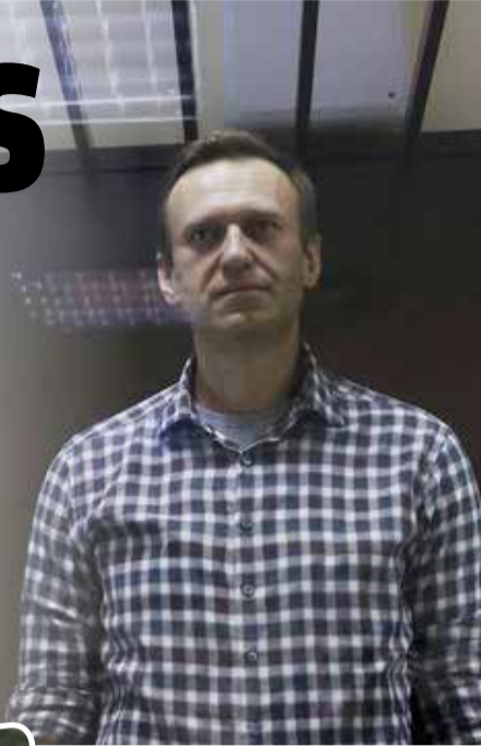
Navalny attends a court hearing in Moscow, Russia