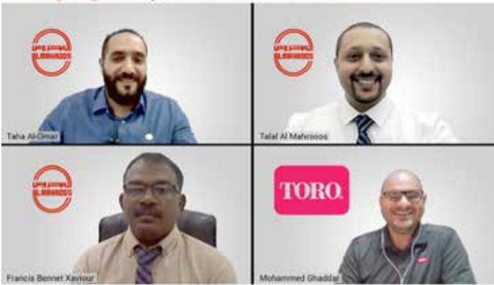
Al Mahroos Company and Toro representatives hold talks online

M H Al Mahroos BSC(c) Announces Partnership with Toro, leading irrigation systems in KSA & Bahrain