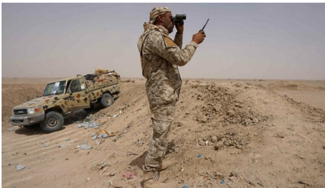
Yemen government forces hold a position against Houthi rebels in Marib

The attack on Marib stirred up violence in other areas, including government-held Tazi province, which is besieged by the Houthis. Clashes also took