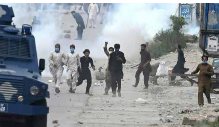
(P) was banned Thursday after days of violent protests

The group Tehreek-e-Labbaik Pakistan (TLP) was banned Thursday after days of violent protests during which four policemen were killed.