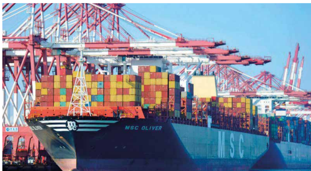
Bahrain exports BD684 million worth of products

This was according to the Information and eGovernment Authority (iGA) foreign trade report of the first quarter of 2021, encompassing data on the balance of trade, imports, exports