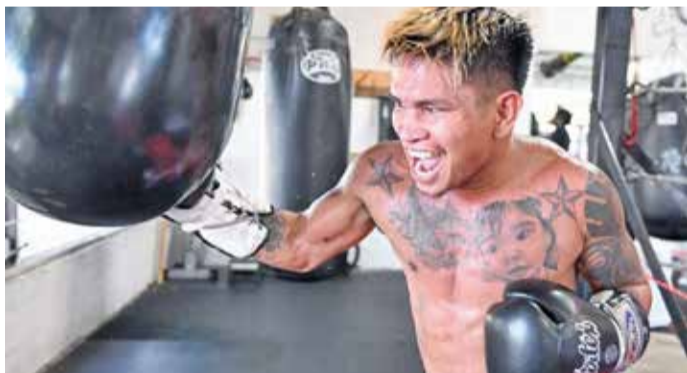
Casimero's skills and bravado will be tested against Rigondeaux

They were supposed to meet last April 25 at Mandalay Bay