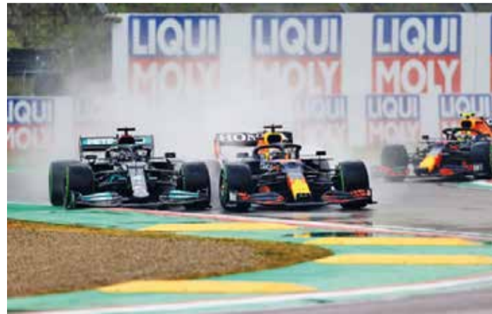
Max Verstappen (centre) overtakes Lewis Hamilton in the wet on lap one of the Emilia Romagna F1 Grand Prix

After winning the season-opener in Bahrain and put-