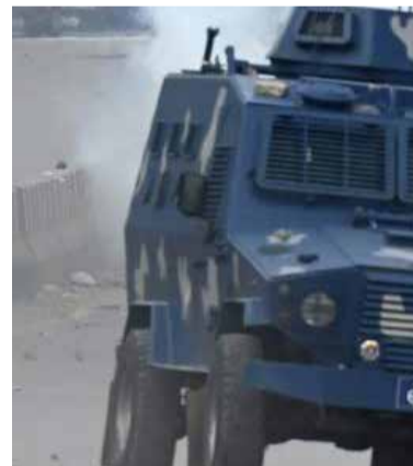
The group Tehreek-e-Labbaik Pakistan (TLB)...