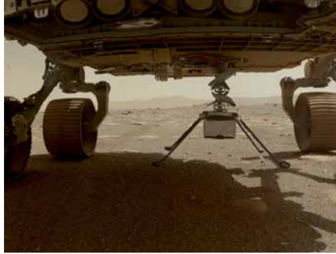
NASA's Ingenuity Mars Helicopter, with all four of its legs deployed, is pictured before dropping from the belly of the Perseverance rover in March 2021