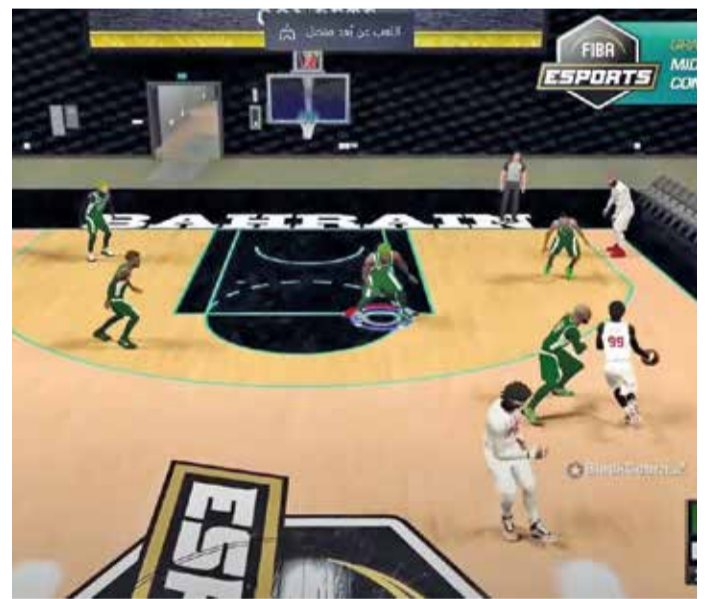
Action from Bahrain's first game against Saudi Arabia yesterday

Bahrain's team in the tournament featured game characters including "||-Rodman-||", controlled by Jassim Ali, "Clutch-69gamer" (Hussain Alban-