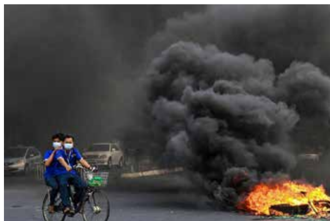
The coup in Myanmar has sparked mass protests against the military junta