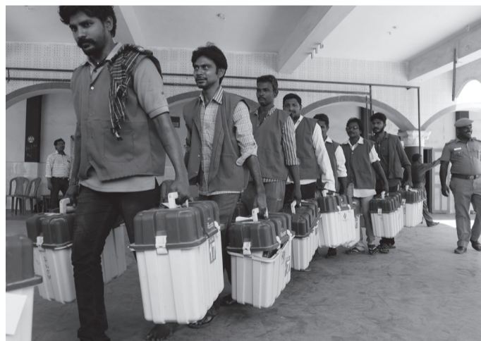
Indian election workers carry boxes containing Electronic Voting Machines (EVM) at a distribution point in Chennai ahead of the second phase of India's general election.

ans vote in a mammoth national election being held over several phases, the next of which begins Thursday.