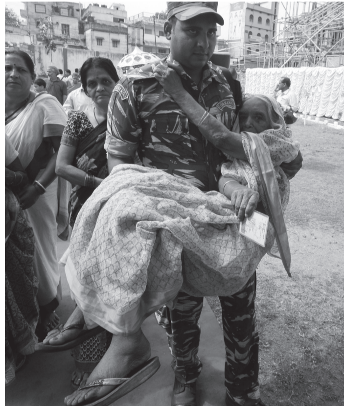
An Indian soldier carries an 93-year-old woman to cast her vote at a polling station in the Indian state of Bihar

The BJP has promised a $1.4-trillion infrastructure blitz to create jobs.