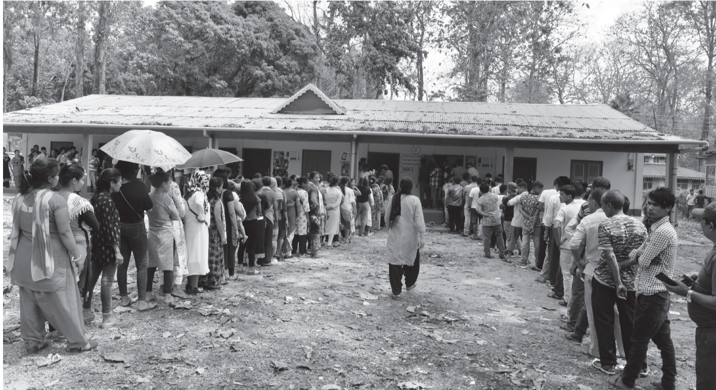
Indian voters queue up to cast their vote at a polling station in Rohini village some 27km from Siliguri in West Bengal

At some polling stations in tense Kashmir state, security forces outnumbered voters with tens of thousands of troops, par-