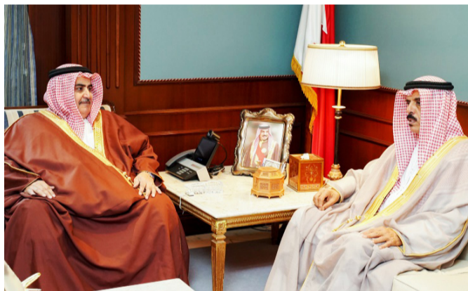
Minister of Foreign Affairs, Shaikh Khalid bin Ahmed bin Mohammed Al Khalifa in his office at the Ministry's General Court with the Minister of Education, Dr Majid bin Ali Al Nuaimi. Discussions focused on enhancing cooperation between the ministries in all forums as well as regional and international organisations concerned with education