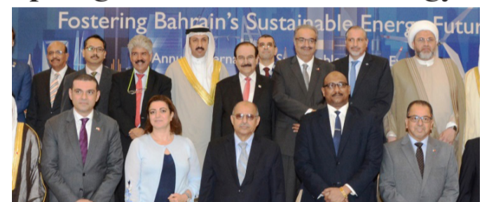
Officials during a photocall