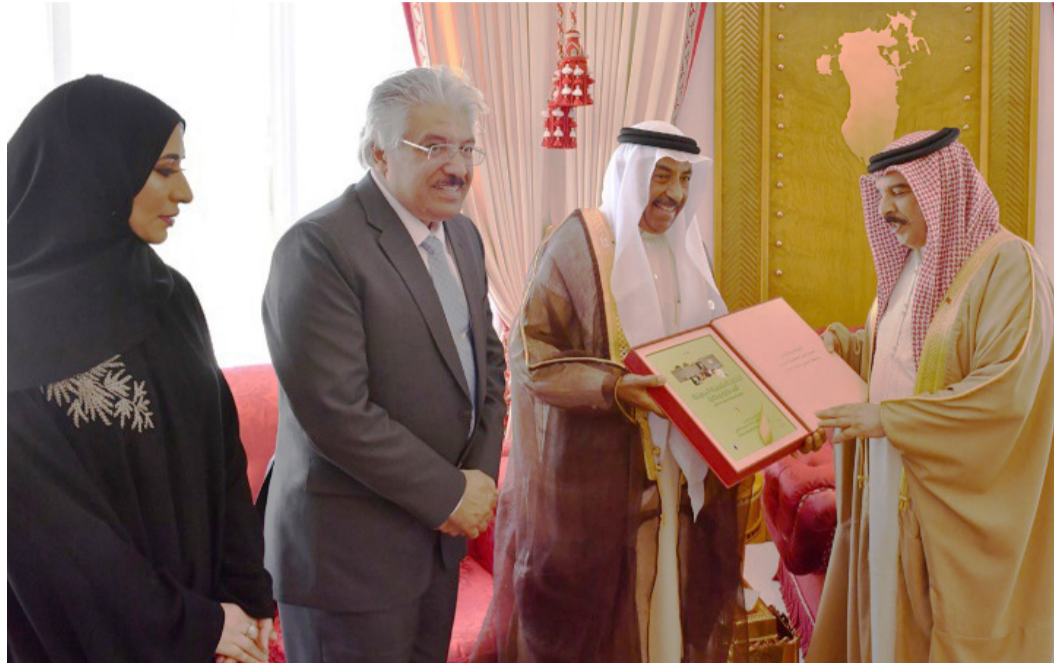
His Majesty being presented with a field survey which includes folk tales in the Arab world

The field survey was conducted with the support of 100 UoB students, and financed by IOV