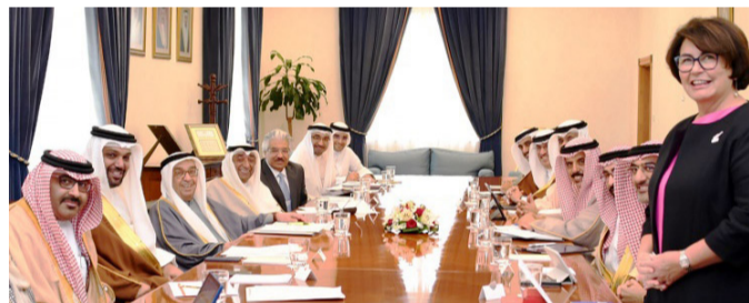
HH Shaikh Mohammed bin Mubarak Al Khalifa, Deputy Prime Minister and Chairman of the Supreme Council for the Development of Education and Training chairing a meeting on the key performance indicators of the education and training development project. The meeting highlighted the achievements of Bahrain Teachers College (BTC) and adopted a plan for the next academic year

The project in its next phase aims to promote Bahraini folk tales internationally.