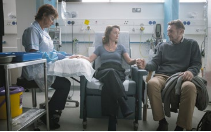
Lesley Manville and Liam Neeson in 'Ordinary Love'

Ordinary Love is a 2019 romantic drama film, directed by Lisa Barros D'Sa and Glenn Leyburn, from a screenplay by Owen McCafferty. It stars Liam Neeson and Lesley Manville. It had its world premiere at the Toronto International Film Festival on 9 September 2019. It was released in the United Kingdom on 6 December 2019, by Focus Features. Ordinary Love, which is directed by Lisa Barros D'Sa and Glenn Leyburn ( who also made Good Vibrations, a 2013 movie set in Ireland's punk music scene), tracks a traumatic year in the life of retired couple Joan (Lesley Manville) and Tom (Liam Neeson) after Joan is diagnosed with breast cancer. The quiet flow of their days before she got sick — daily power-walks on a peaceful Irish shoreline, amiable squabbling at the supermarket over what doesn't need to go in the shopping cart — is rudely displaced by a staccato new normal of hospital stays coloured in chilly blues, punctuated by returns to the murky browns of a cozy