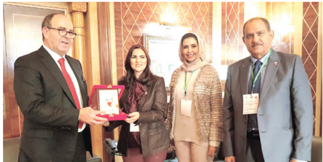
Mr Benchamach receives the Shura Council delegation.

Morocco's House of Councillors' president expressed deep pride in the steady progress of the brotherly Bahraini-Morocand coordination in various erings. fields, especially the legislative one