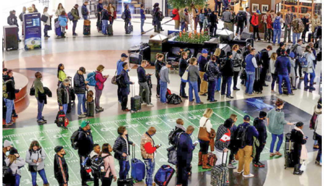
Long lines are seen at a Transportation Security Administration (TSA) security checkpoint at Hartsfield-Jackson Atlanta International Airport amid the partial federal government shutdown, in Atlanta, Georgia, yesterday. Nearly 90 per cent of Americans who oppose an expansion of the border wall say Congress should not pass a bill including Mr Trump's request for wall funding if it is the only way to end the shutdown. Of those who back the wall, nearly three-quarters find it equally unacceptable for a deal to exclude wall funding.