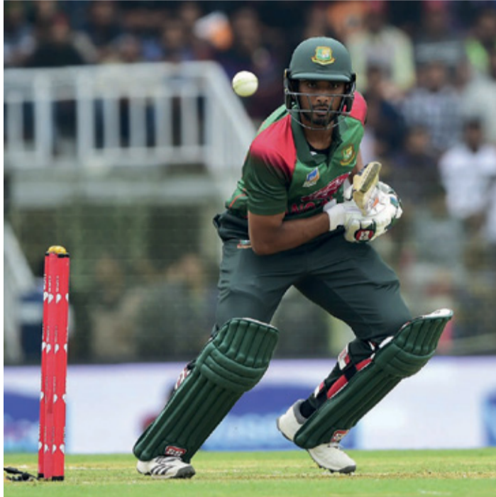
Bangladeshi cricketer Mohammad Mahmudullah plays a shot

Cottrell and fellow pacer Osane Thomas earlier choked