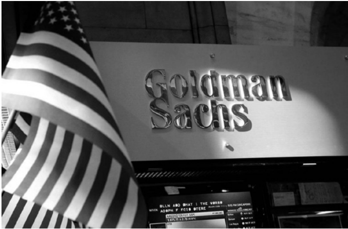
A view of the Goldman Sachs stall on the floor of the New York Stock Exchange in New York, US

Malaysia filed criminal charges yesterday against Goldman Sachs and two of its former employees over the alleged theft of billions of dollars, heaping fresh pressure on the Wall Street titan over the 1MDB scandal.