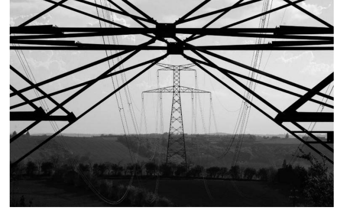
The planned buyout of ABB's power grid unit would reportedly make Hitachi the world's biggest player in the sector