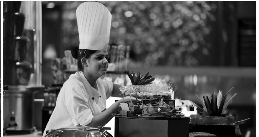
A chef arranges dishes in Four Seasons Hotel