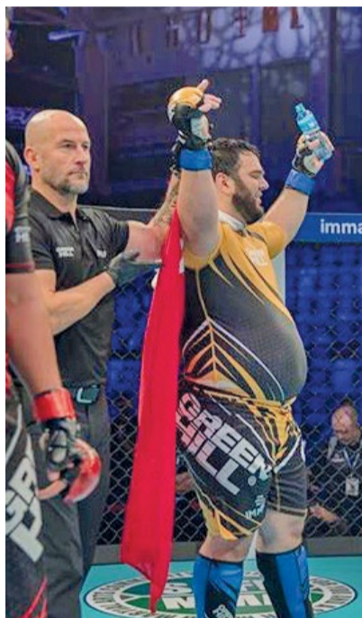
Team Bahrain won four more gold medals on the last day