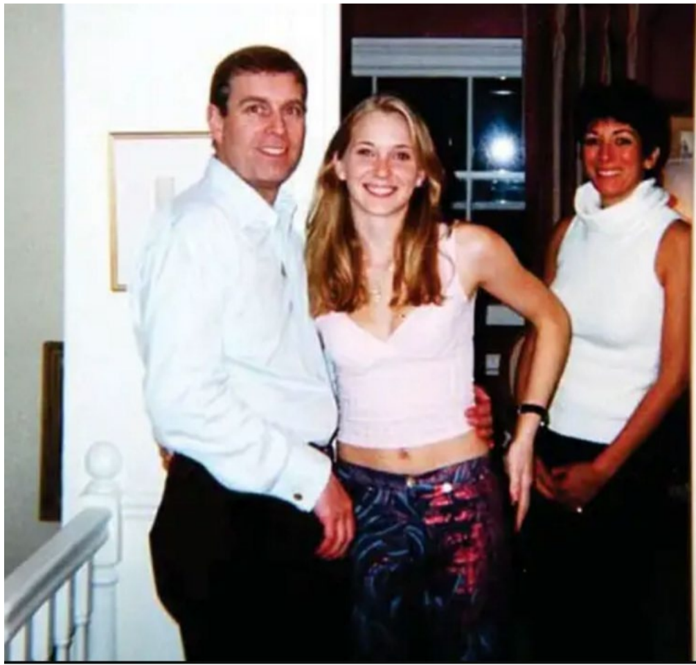
Prince Andrew and Virginia Giuffre, then known as Virginia Roberts, along with Ghislaine Maxwell. This photo was included in an affidavit where Giuffre claimed Prince Andrew directed her to have sex with him.

Andrew claimed he was “at home with the children” on the March 2001 night Giuffre alleges they had sex, after earlier taking his daughter Princess Beatrice to a pizza restaurant near London. The interview dominated the