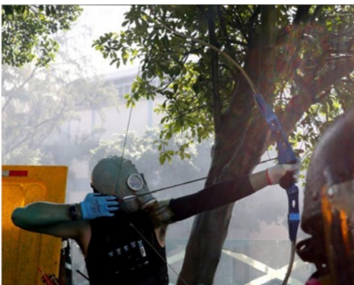
An anti-government protester uses a bow during clashes with police outside Hong Kong Polytechnic University in Hong Kong

Police deployed water cannon and tear gas against protesters occupying the campus in the Hung Hom area of Kowloon, now a key battleground as the