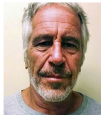
A coroner ruled that Epstein committed suicide by hanging

A coroner ruled that he committed suicide by hanging, while awaiting trial on federal